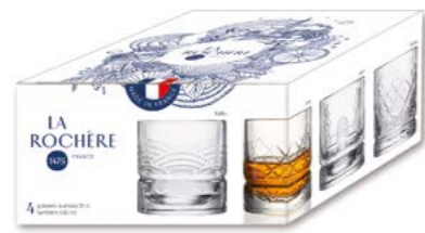
DANDY Set 4 Whisky tumblers

H : 21 cm ø : 0,8 cm Advised retail price: 16.30€