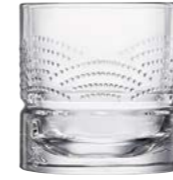
Whisky tumbler Kaïto

H : 9 cm / ø : 8,6 cm Cl : 25 / Oz : 8,82 Advised retail price: 6.40€