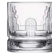
Whisky tumbler John

H : 9 cm / ø : 8,6 cm Cl : 30 / Oz : 10,58 Advised retail price: 6.40€