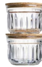
Set of 2 Delight large cork lid model

H : 20,8 cm / ø : 10,5 cm Cl : 60 / Oz : 21,16 Advised retail price: 22.00€