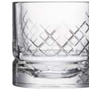
Whisky tumbler Glen

H : 9 cm / ø : 8,6 cm Cl : 25 / Oz : 8,82 Advised retail price: 6.40€