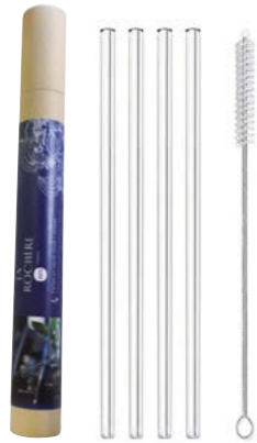
Set de 4 Glass Straws and a cleaning brush

H : 21 cm ø : 0,8 cm Advised retail price: 16.30€