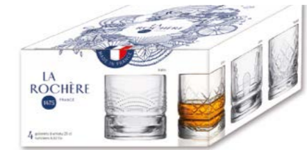
Set of 4 assorted DANDY whisky tumblers

H : 9 cm / ø : 8,6 cm Cl : 30 / Oz : 10,58 Advised retail price: 28.00€