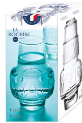
BOSTON WATER desk jug

H : 9 cm / ø : 8,6 cm Cl : 30 / Oz : 10,58 Advised retail price: 28.00€