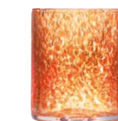
Orange whisky tumbler*

H : 9,8 cm ø : 8 cm Cl : 35 / Oz : 12,35 Advised retail price: 29.00€