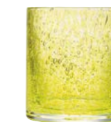
Yellow whisky tumbler*

H : 9,8 cm ø : 8 cm Cl : 35 / Oz : 12,35 Advised retail price: 29.00€