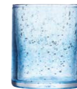
Blue whisky tumbler*

H : 9,8 cm ø : 8 cm Cl : 35 / Oz : 12,35 Advised retail price: 29.00€