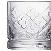
Whisky tumbler Patrick

H : 9 cm / ø : 8,6 cm Cl : 30 / Oz : 10,58 Advised retail price: 6.40€