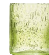
Green whisky tumbler*

H : 9,8 cm ø : 8 cm Cl : 35 / Oz : 12,35 Advised retail price: 29.00€