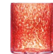
Red whisky tumbler*

H : 9,8 cm ø : 8 cm Cl : 35 / Oz : 12,35 Advised retail price: 29.00€