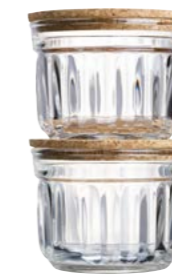
Set of 2 Delight large cork lid model /tempered glass

H : 7,3 cm / ø : 9,65 cm Cl : 29 / Oz : 13,4 Advised retail price: 29.00€