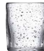
Clear whisky tumbler

5286 25 H : 26,4 cm ø : 8,4 cm Cl : 100 / Oz : 35,27 Advised retail price: 59.00€