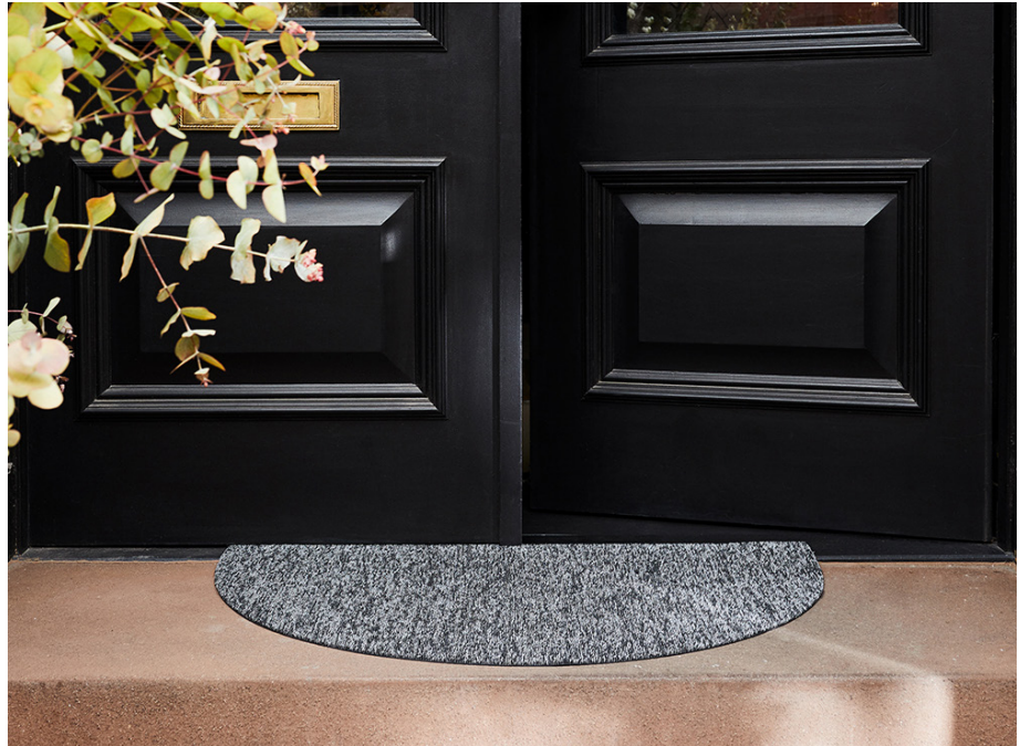
GREY, Welcome Mat

Breton Stripe is the newest addition to the Shag mat range. Shag mats are made by tufting Chilewich's TerraStrand yarns onto a primary backing and then binding them to base of hardworking vinyl. Ideal for entryways, bathrooms, kitchens, patios, and pool areas, these quick-drying mats are resistant to mold, mildew, and chlorine. Breton Stripe is inspired by the high-contrast uniform of French navy seamen in northern France. This classic stripe is reimagined through a tufted texture in two colorways: Blueberry and Gravel. The season also brings two new colorways—Forest and Mulberry—for the popular Skinny Stripe Shag mat.