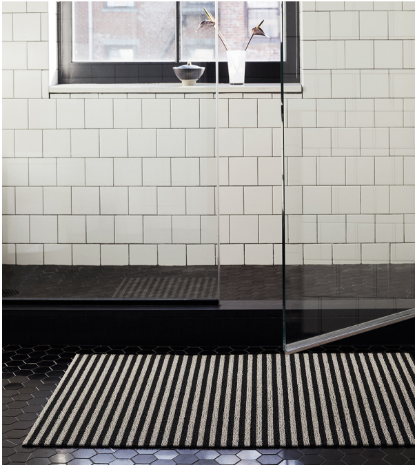
GRAVEL, Breton Stripe

Debuting in both table mats and floor mats is Quill . In this variation on a twill weave, the timeless exuberance of flame-stitch needlework meets the shade-shifting dimension of bi-color yarns. Quill is especially dense, creating a rich surface in which the chevron pattern interacts with tonal stripes in three colorways: Forest, Mulberry, and Sand.