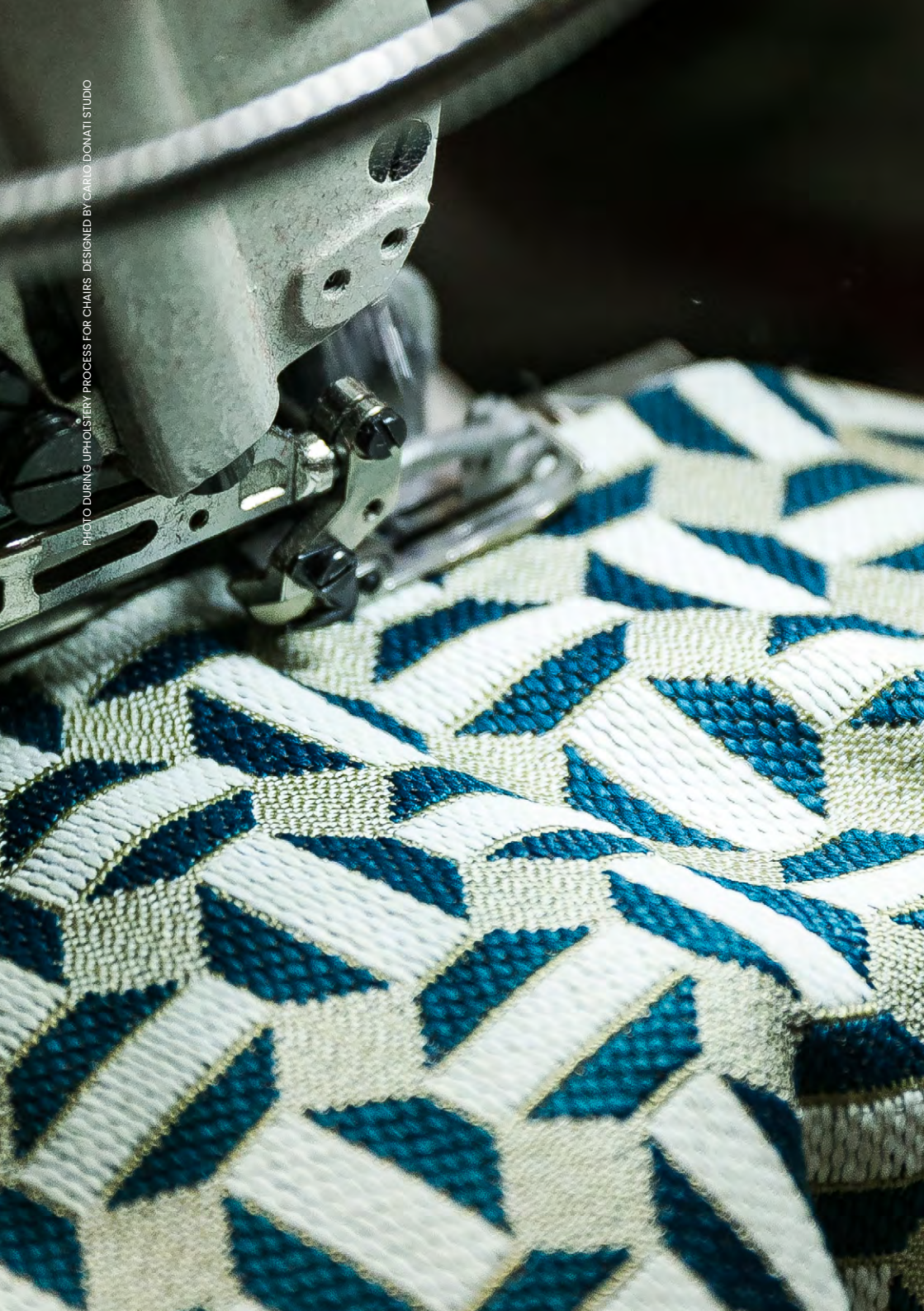
PHOTO DURING UPHOLSTERY PROCESS FOR CHAIRS. DESIGNED BY CARLO DONATI STUDIO