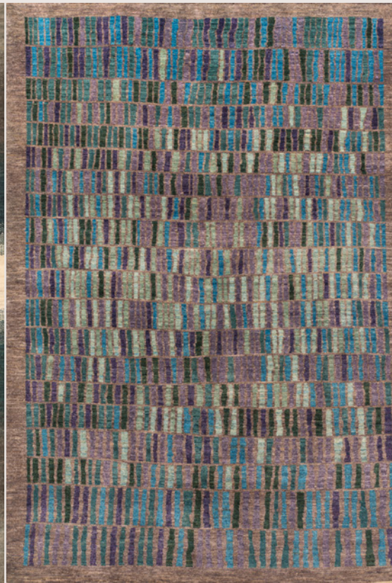
Slender Mosaic Tiles, Gabbehs Abstract & Plain