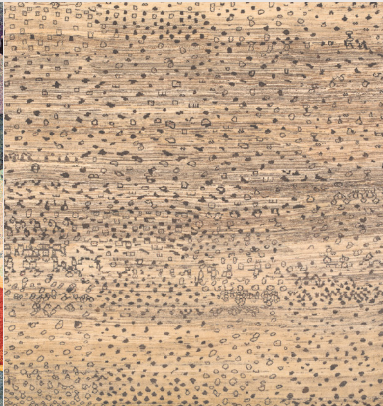
Inverted Snakeskin 1, Gabbehs Flora & Fauna