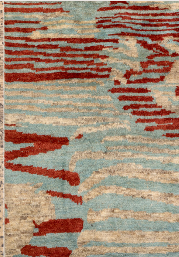
Stippled Brushstrokes 1, Gabbehs Abstract & Plain