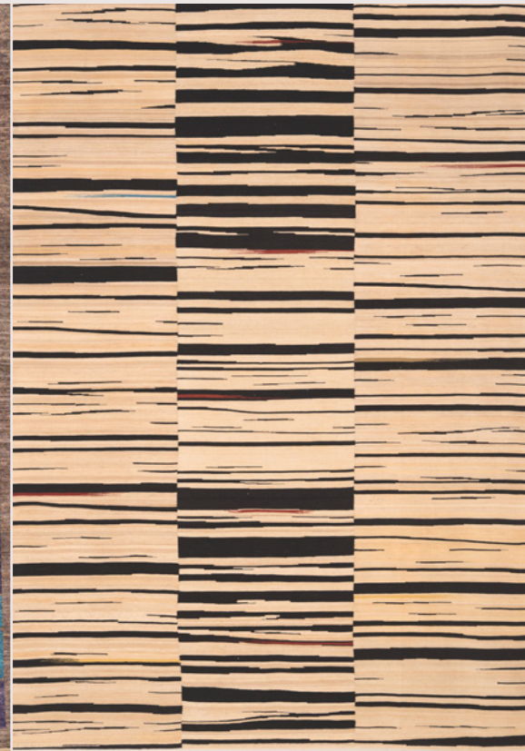
'Sumi' brush-strokes 2 Baneh kelim, Flatweaves Minimalist