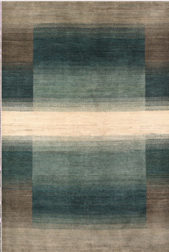
Chimera 24, Gabbehs Abstract & Plain