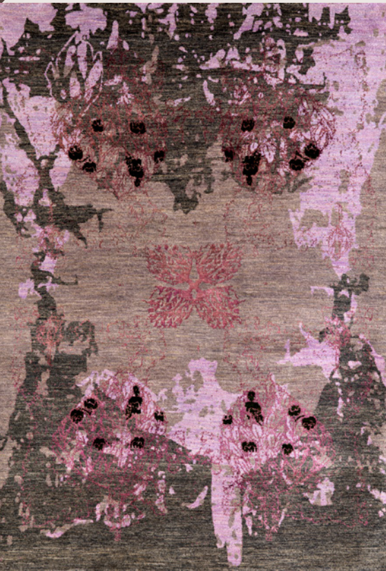
Derakhte Anar in Lilac, Purple & Grey 1a, Designer Isfahan