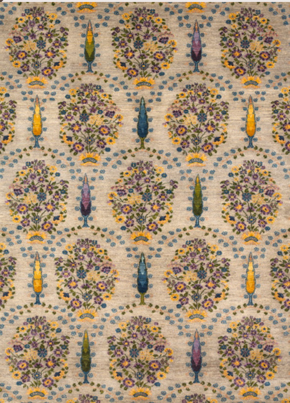
Garlands & Cypresses 1, Gabbehs Flora & Fauna