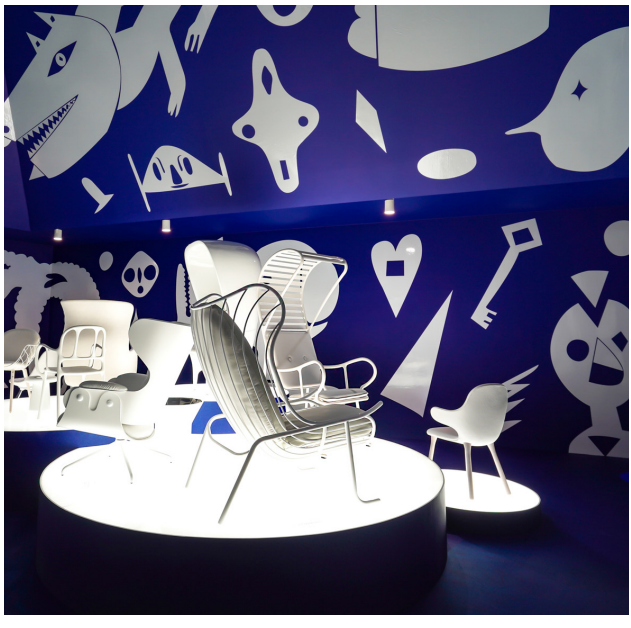
'Serious Fun' Exhibition, Daelim Museum Korea