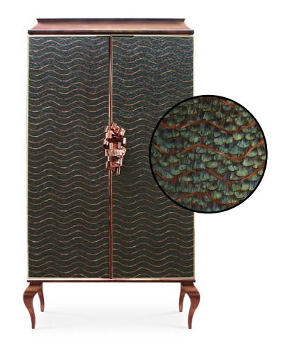
DIVINE | ARMOIRE