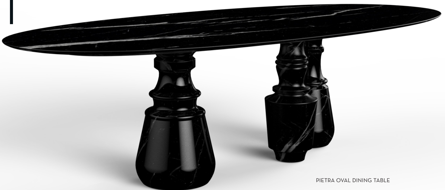
PIETRA OVAL DINING TABLE

Boca do Lobo prompt bittersweet emotions and stimulate intimate feelings of belonging. Each piece has a unique, timeless character, revealing an attention to the smallest details.