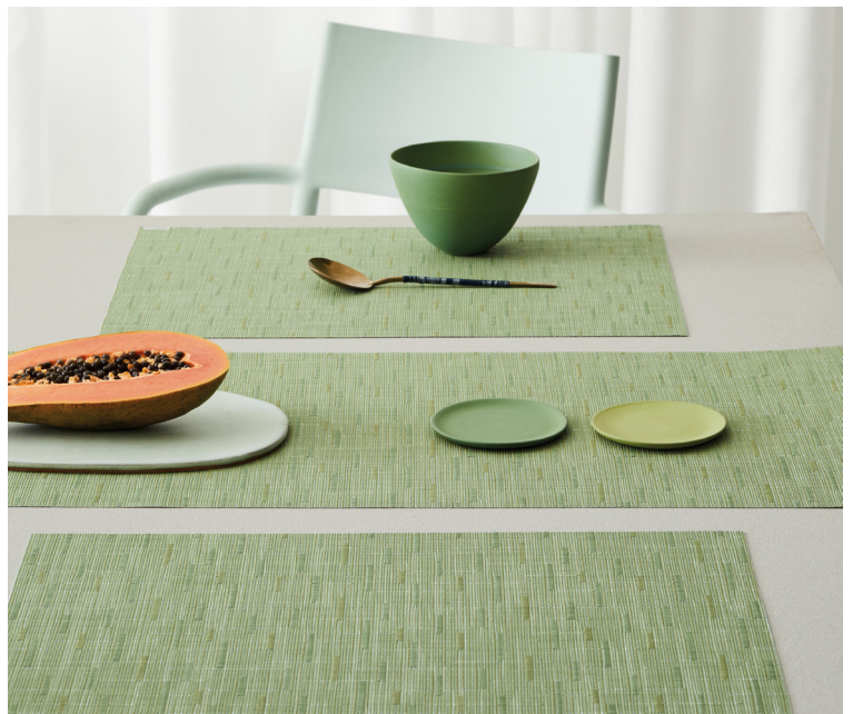
SPRING GREEN, Bamboo

The Spring/Summer 2020 collection also expands the palettes for a broad range of existing designs. New to the Heddle range of placemats and woven floor mats is the Pebble colorway, which balances bold texture with warm neutrals. Bamboo gains dimension with Coconut and Rain (for tabletop and floor) and Spring Green (tabletop only).