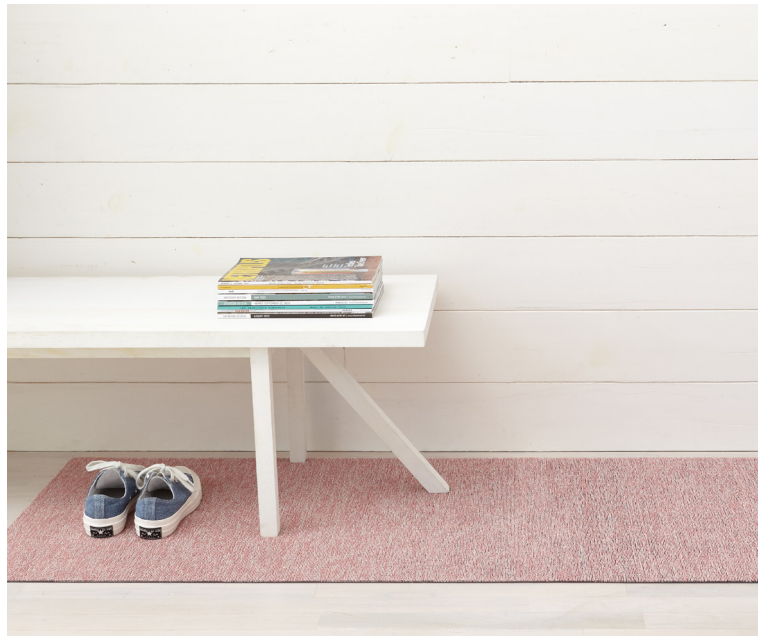
BLUSH, Heathered Shag

The Shag floor mat range introduces Peach and Pebble to the popular Bold Stripe design, while the bestselling Heathered Shag mats add Blush and Pebble. Shag mats are made by tufting custom-extruded yarns onto a primary backing and then binding them to base of hardworking vinyl. Ideal for entryways, bathrooms, kitchens, terraces, and pool areas, these quick-drying mats are resistant to mold, mildew, and chlorine.