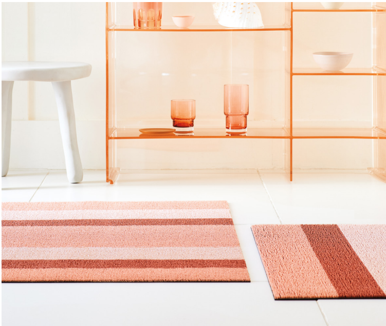
PEACH, Bold Stripe Shag

The Spring/Summer 2020 collection also expands the palettes for a broad range of existing designs. New to the Heddle range of placemats and woven floor mats is the Pebble colorway, which balances bold texture with warm neutrals. Bamboo gains dimension with Coconut and Rain (for tabletop and floor) and Spring Green (tabletop only).