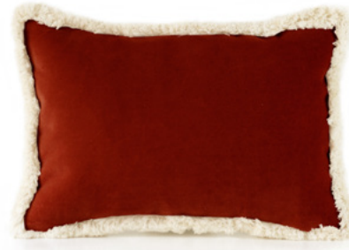
1. Daisy II Brick