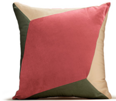
3. Quartz I Rose & Dry Green

Size ap. 45x45 cm Concealed zipper 100% cotton velvet Hand Tailored in Portugal