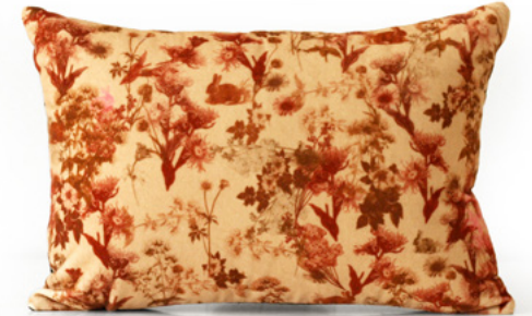
2. Magical Bunny II Beige