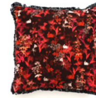
MAGICAL BUNNY WINE - FRINGED