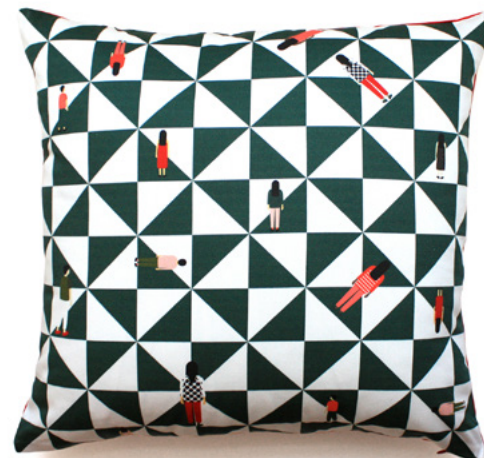
1. Ride Green

Size ap. 45x45 cm Concealed zipper Eco-friendly digital print on 100% cotton fabric Back: red cotton canvas Made in Portugal