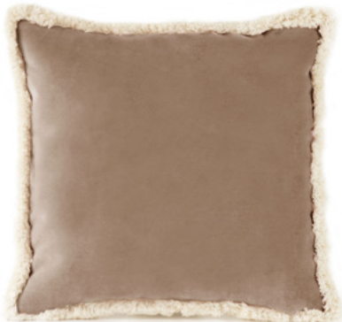
4. Daisy I Cappuccino