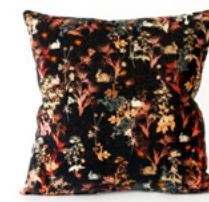
MAGICAL BUNNY BLACK