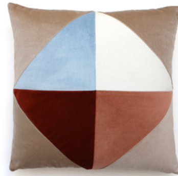
4. Diamond Earth