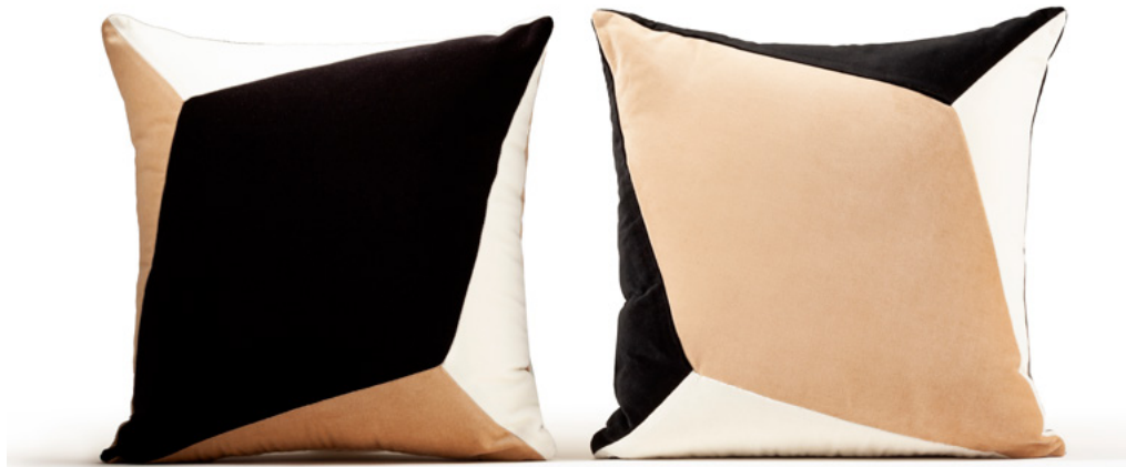
1. Quartz I Black & White