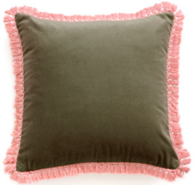
1. Iris Dry Green