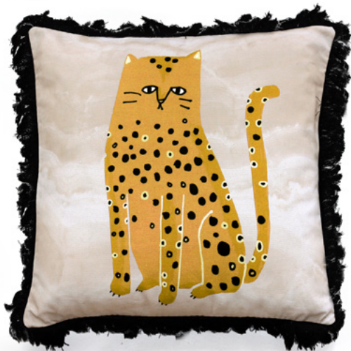
2. Fat Cat Yellow