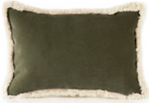
DAISY II DRY GREEN