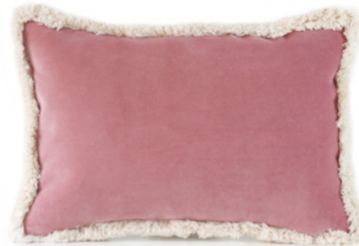
3. Daisy II Pastel Pink