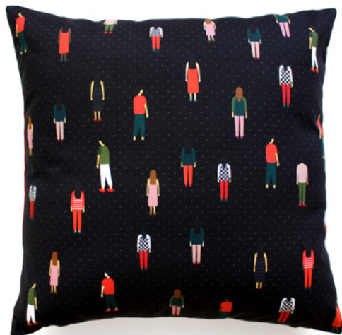
1. Dive Black