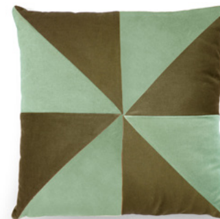
5. Safira Green