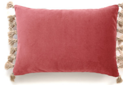
1. Blush Rose