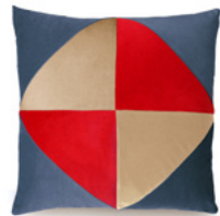
DIAMOND PETROL & RED