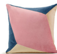
QUARTZ II PETROL & PINK