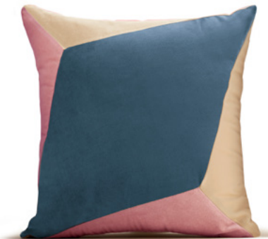
5. Quartz I Petrol & Pink