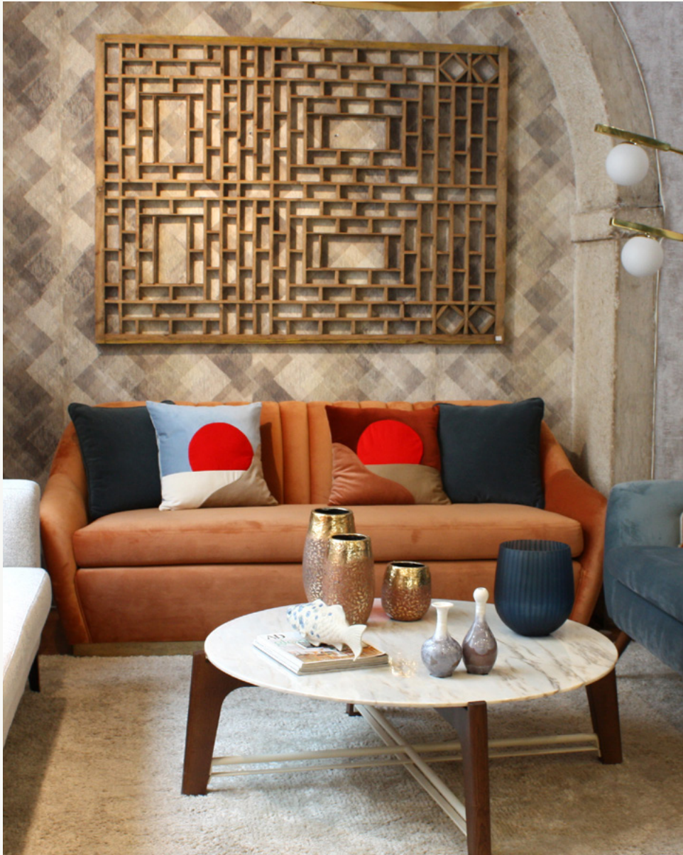
Roof Design Studio - Lisboa PT