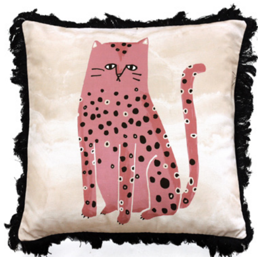
1. Fat Cat Pink