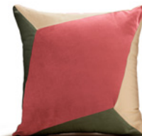
QUARTZ I ROSE & DRY GREEN