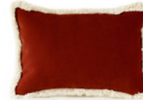
DAISY II BRICK