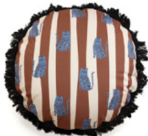
FAT CAT II BROWN