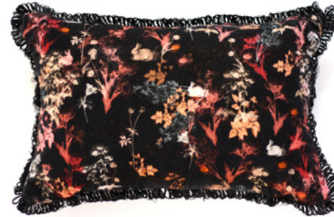
1. Magical Bunny II Black - fringed