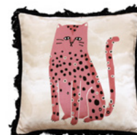
FAT CAT PINK