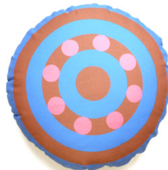
5. OOOH Swirl