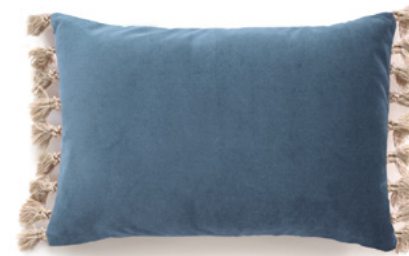
3. Blush Petrol