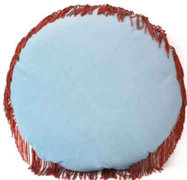
3. Turquoise Pastel Blue