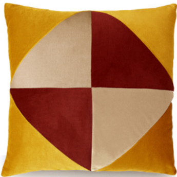
3. Diamond Brick & Mustard