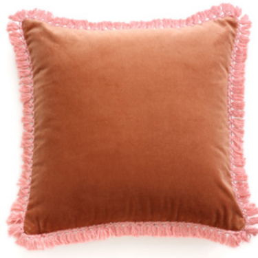
2. Iris Camel