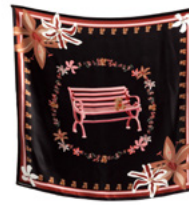
LOVE GARDEN SCARF