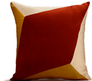
7. Quartz I Brick & Mustard