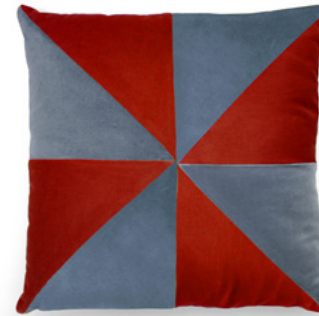
1. Safira Brick & Petrol

Size ap. 45x45 cm Concealed zipper 100% cotton velvet Hand Tailored in Portugal