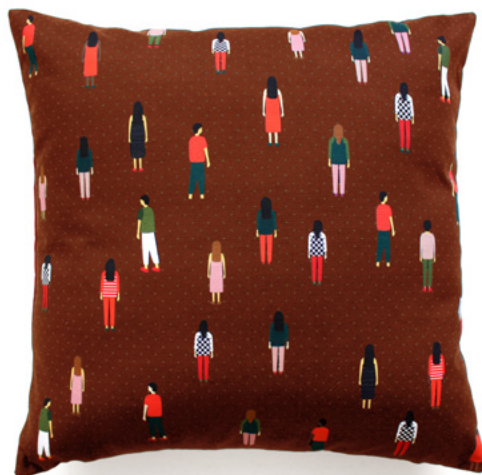
2. Dive Brown