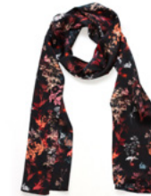
MAGICAL BUNNY LONG SCARF