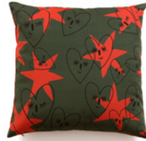
WINK OF LOVE