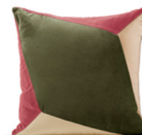
QUARTZ II ROSE & DRY GREEN