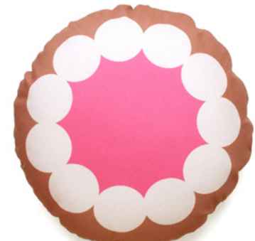
4. OOOH Merengue