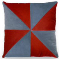
SAFIRA BRICK & PETROL