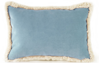
2. Daisy II Pastel Blue