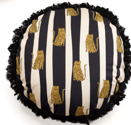
2. Fat Cat II Yellow