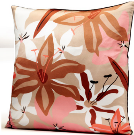
2. Dalila Pink