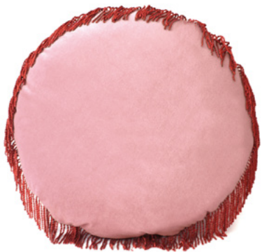
1. Turquoise Pastel Pink