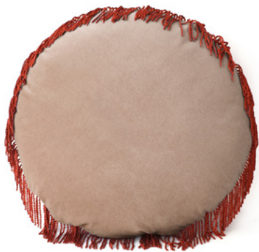
2. Turquoise Cappuccino