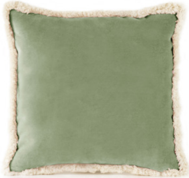
3. Daisy I Mint