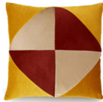
DIAMOND BRICK & MUSTARD