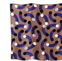
MUSH MUSH SCARF