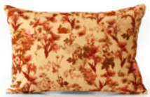
MAGICAL BUNNY II BEIGE