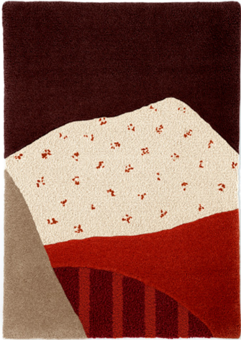
HO CHI MINH I