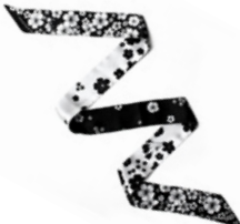
SAKURA TWILLY SCARF