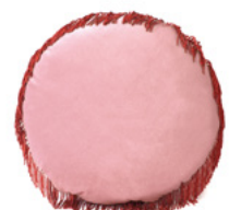
TURQUOISE PASTEL PINK