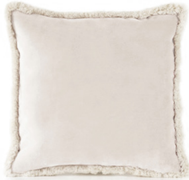
2. Daisy I Ivory