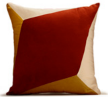
QUARTZ I BRICK & MUSTARD