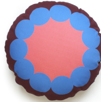
1. OOOH Berry