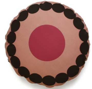
2. OOOH Wine