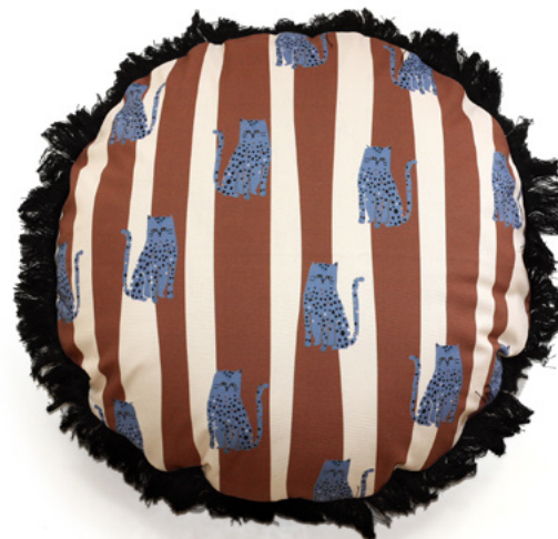
1. Fat Cat II Brown & Blue

Size ap. 45x45 cm Concealed zipper Eco-friendly digital print on 100% cotton fabric, black cotton fringes Back: black cotton canvas Made in Portugal