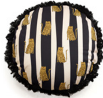
FAT CAT II BLACK