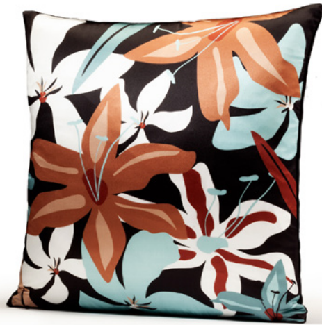
1. Dalila Blue