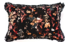
MAGICAL BUNNY II BLACK - FRINGED