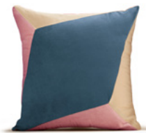
QUARTZ I PETROL & PINK