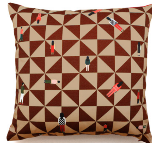
2. Ride Brown