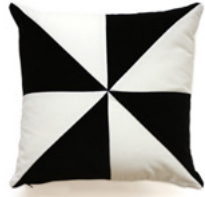
SAFRIA BLACK & WHITE