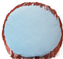
TURQUOISE PASTEL BLUE