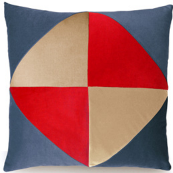
1. Diamond Petrol & Red