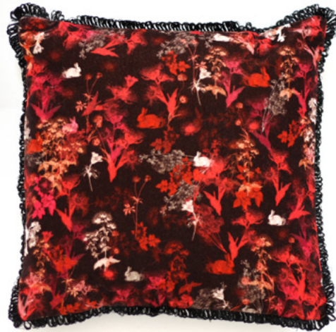
2. Magical Bunny Wine - Fringed