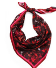
MAGICAL BUNNY LARGE SCARF