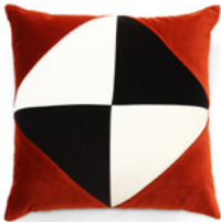
DIAMOND BLACK & WHITE