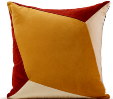
8. Quartz II Brick & Mustard