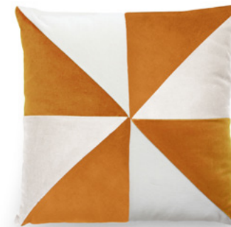
3. Safira Mustard