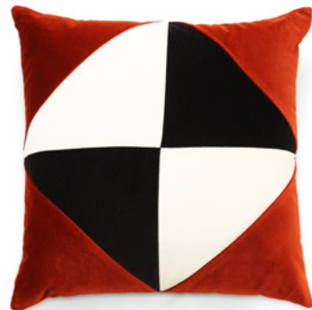
2. Diamond Black & White