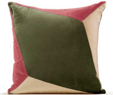
4. Quartz II Rose & Dry Green