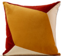
QUARTZ II BRICK & MUSTARD