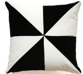
2. Safira Black & White