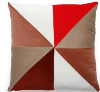
4. Safira Earth