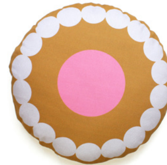
3. OOOH Honey