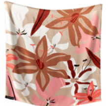
DALILA PINK SCARF