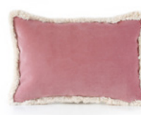
DAISY II PASTEL PINK