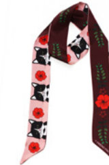
CLEO TWILLY SCARF