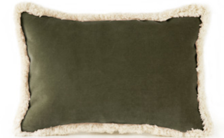
3. Daisy II Dry Green