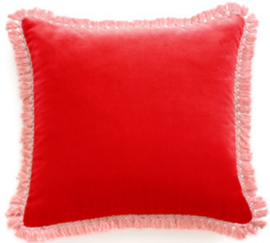
3. Iris Red