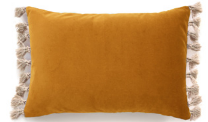
2. Blush Mustard