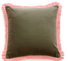
IRIS DRY GREEN