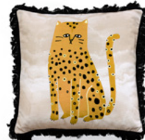
FAT CAT YELLOW