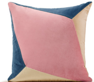
6. Quartz II Petrol & Pink