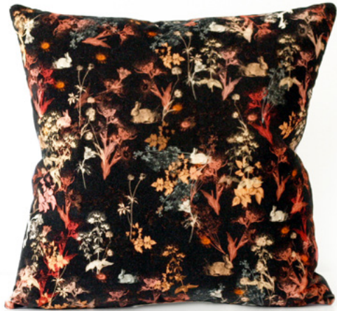
1. Magical Bunny Black