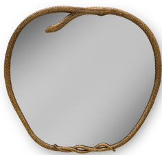
SERPENTINE II | MIRROR