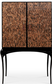
TEMPTATION | BAR CABINET

KOKET has a magical way of engaging its customers and brand loyalists so they feel like members of an exclusive community. If you have ever visited the brand at a trade show you are sure to have felt the warmth, energy, and passion that is KOKET! Celebrate the regenerative power of KOKET's timeless style this Winter in Hall 8 Stand B30 at Maison & Objet Paris, January 17 - 21, 2020, and be sure to pick up the new issue of Love Happens magazine!