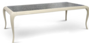
MERVEILLE | DINING TABLE