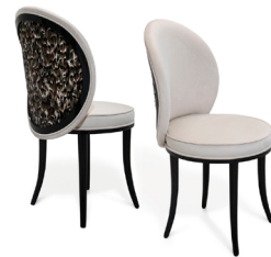
MERVEILLE | DINING CHAIR