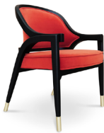
ARENDAAL | CHAIR

The debut of KK by KOKET will bring a fresh appeal to KOKET's stand, but the alluring glamour of KOKET's iconic statement designs will be nonetheless present. A curated selection of exquisite KOKET objects of desire will be ready to seduce all who pass by. The brand's sig-