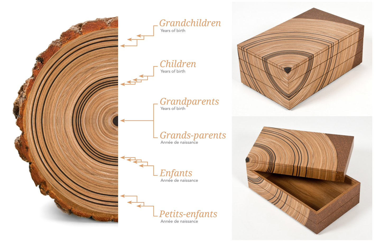
Family Tree keepsake box - Elm & Fumed Oak 38cm (w) x 15cm (h) x 23.5cm (d)

Edward's 'Family Tree' keepsake box is designed to evoke a slice through a tree with the surface pattern made with his own unique 'Murano' veneers. The pattern represents annual growth rings with inlaid contrasting woods symbolising the years of birth of three generations of a family. In contrast, the end of the box plays with the eye by suggesting the rough character of tree bark. Inspired by traditional Japanese Hakone marguetry and British Tunbridge ware, thousands of tiny end grain squares create a silky-smooth surface with an illusion of texture.