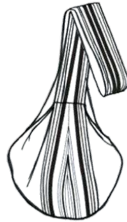
si dilata/it expands