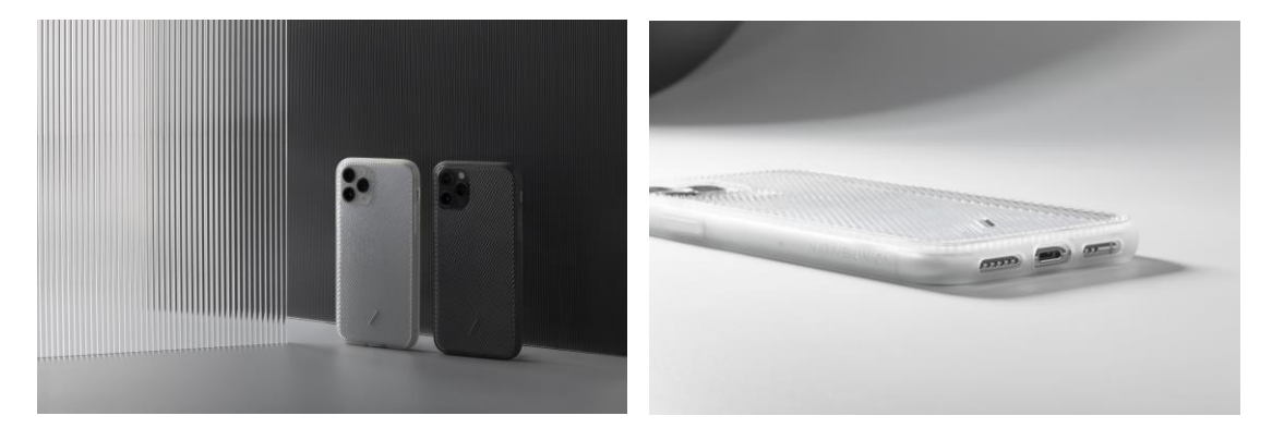
Above left: Clic View in Frost and Smoke, Above right: Clic View in Frost

Also on display will be the new Clic Case collection for the iPhone 11 range. Featuring fan-favorites upgraded with a new construction as well as completely new designs, the new case collection highlights our focus on premium materials and attention to detail. The latest addition to the collection, Clic View, is a textured transparent case with a minimalist form to enhance the design of your iPhone. The ribbed slash texture adds unique character and feel while the slim and lightweight construction provides protection.