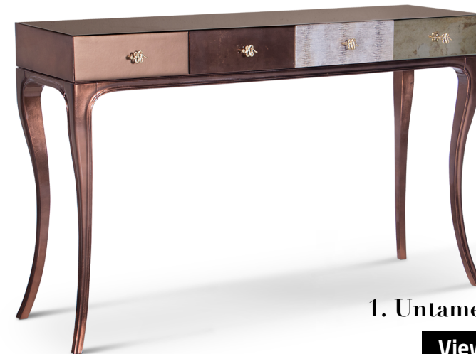
1. Untamed | Console