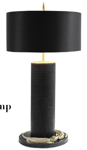
2. Reptilian | Table lamp View more