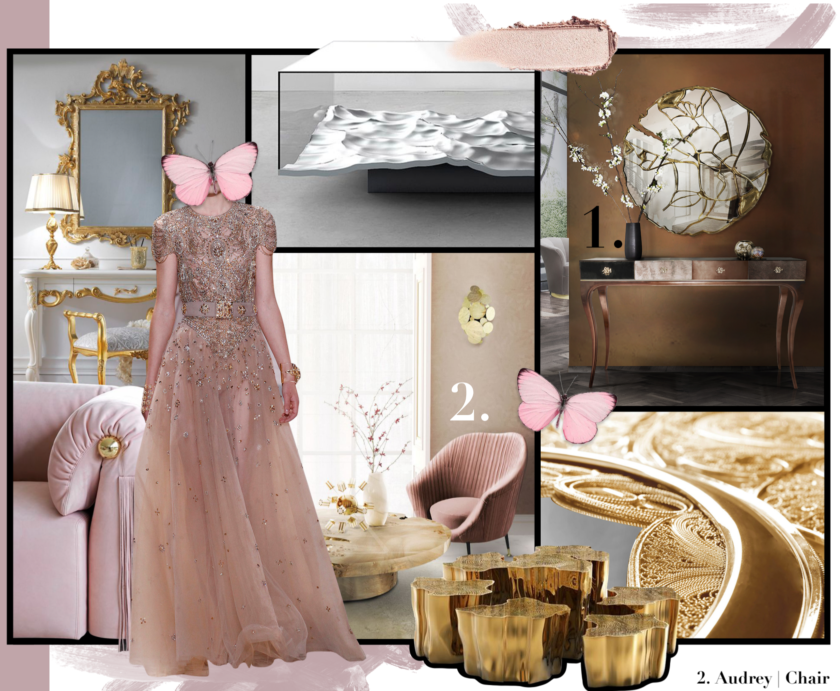
2. Audrey | Chair

A trend for 2019 is a move towards handmade, custom pieces. Whereas customization used to refer to specifying an alteration here or a finish there, today, customization takes on a whole new definition, as designers look to create spaces that are unique and inspiring, they turn to custom furniture pieces to secure that one-of-a-kind space that truly speaks to its occupants since clients now want to know the stories of where their pieces came from, who made them and what process was involved. Clients are now looking for the whole experience and want pieces that grace their homes, reflect who they are, and performs a specific function in their space.