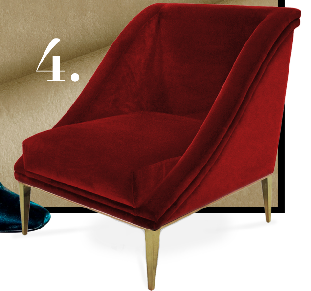
4. Geisha | Chair