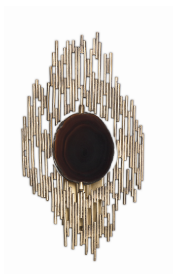
1. Vivre | Sconce