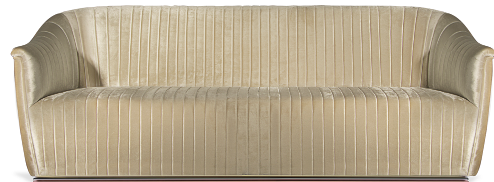
4. Mia | Sofa