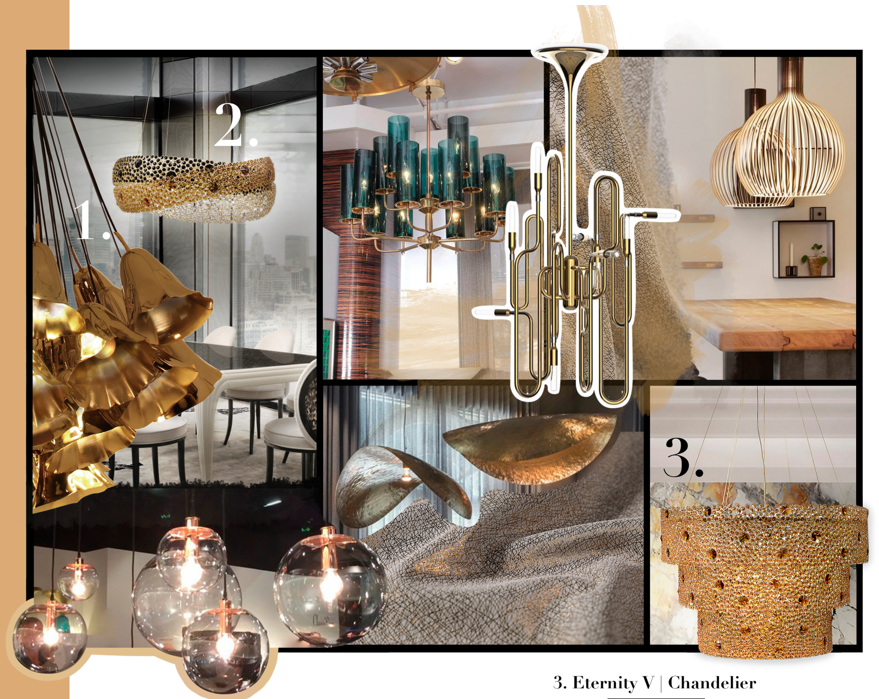
3. Eternity V | Chandelier

1. Gia | Chandelier 2. Trinity | Chandelier 3. Eternity V | Chandelier