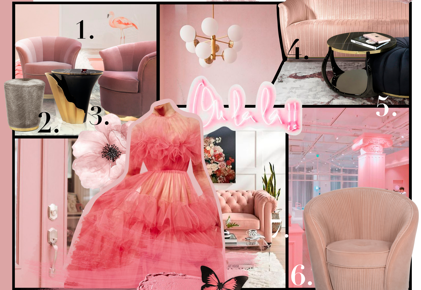
6. Bloom | Chair

1. Besame | Chair 2. Trésor | Stool 3. Yasmine | Side table 4. Mia | Sofa 5. Embrace | Cocktail table 6. Bloom | Chair