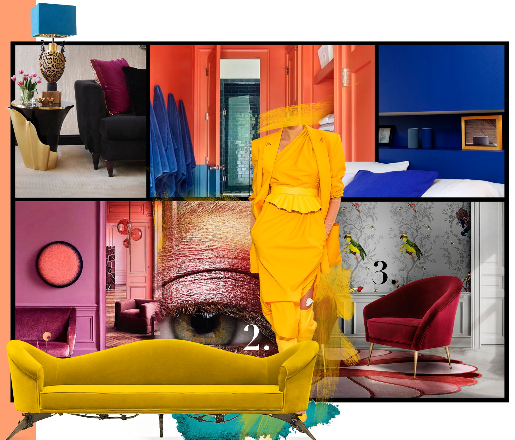
2. Colette II | Sofa

Bold paint colors with muted tones are going to feel more visually soothing. Additionally, determine your level of commitment to the colors you've chosen by containing it to a powder bath or small space. If you're not too sure you want to go all-in, experiment with accessories such as pillows, bedding, and throws. Any space can also be made super cheerful just by introducing a bold and colorful piece of accent furniture.