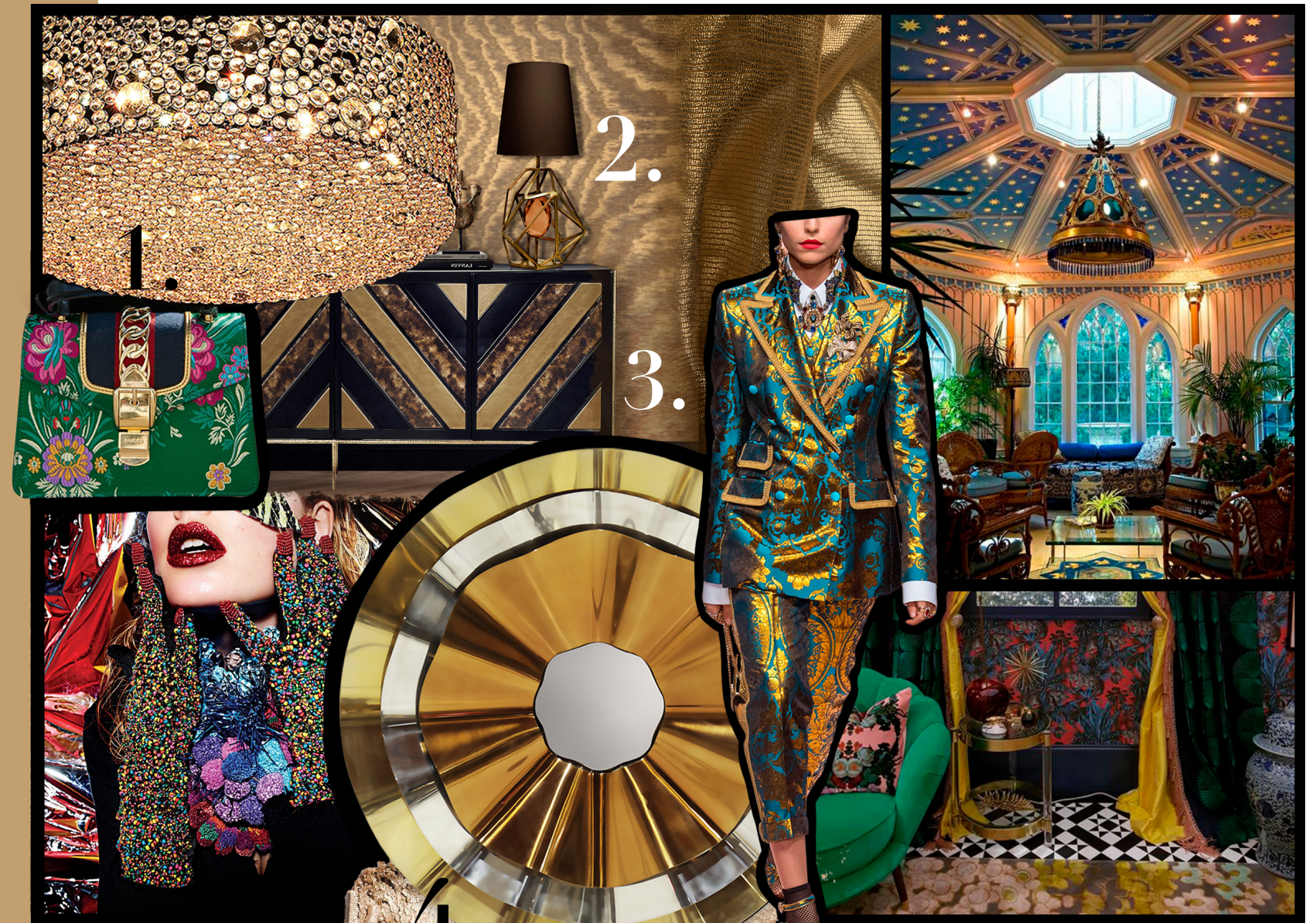
4. Rêve III | Mirror

People love the maximalist decor for its lush colors and the “you can’t mess this up” style it delivers. Decorating trends kept minimalism strong for many years until the idea of the extravagant and the comfort lifestyle swept in. Decorating for comfort meant filling people’s homes with things they love. Maximalism means enveloping the homes with even more of those things. This style isn’t messy or random and you can’t achieve the look simply by filling your space with decor. You don’t have to commit 100 percent to maximalism, but you can borrow the best of the trend to transform your space.