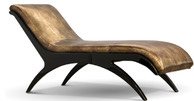
ZEBA | CHAISE