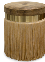
ISABELLA | PUFF

This fashionable puff stool features a unique combination of contrasting materials. One of a trio of KOKET puff designs, the tailored button-tufted seat, polished brass belt and flowing fringed skirt make this lovely lady the perfect accent seat whether standing alone or in a group.