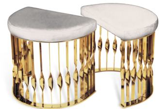
MANDY | STOOL

This fluid and unusual stool transcends design and jewelry. Conceived from a cuff bracelet, the Mandy stool will embellish any setting with its soft velvet upholstery and twisted high-gloss polished brass base.