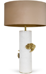
VENGEANCE | TABLE LAMP

Seeking retribution, she fights to take back what is rightfully hers. Cast brass hands grasp the Vengeance lamp's marble column structure embodying her impassioned struggle.