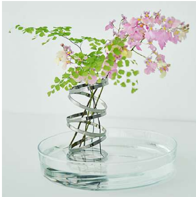
Ring (JPY 7,200)

Allows you to maintain your fresh plants with clean water. Makes firm grip for a single flower while decorating it into a beautiful arrangement. Turns an ordinary container (wine glass, plates) into an elegant vase.