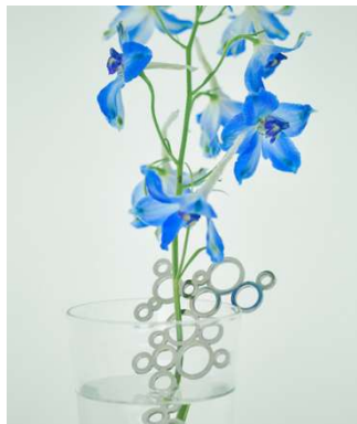
Bubble (JPY 3,700)