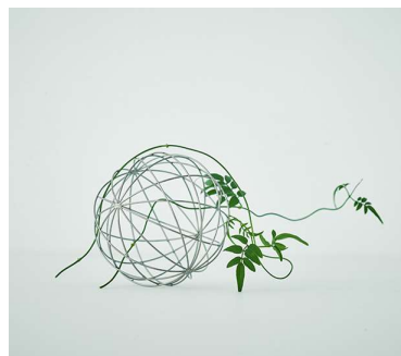
Mirror Ball (JPY 12,800)