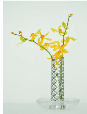
Bangle (JPY 6,800)