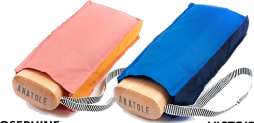
JOSEPHINE Bicolour Pink & Orange

ANATOLE, the first Parisian brand specializing in quality micro-umbrellas, presents its new collection : "Bicolores".