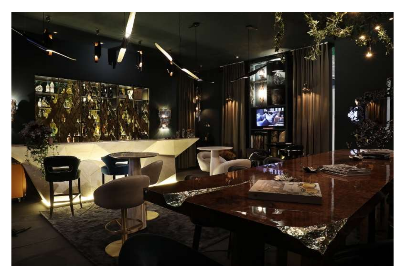
See also: Studio Putman: Attention to Detail and Timeless Design