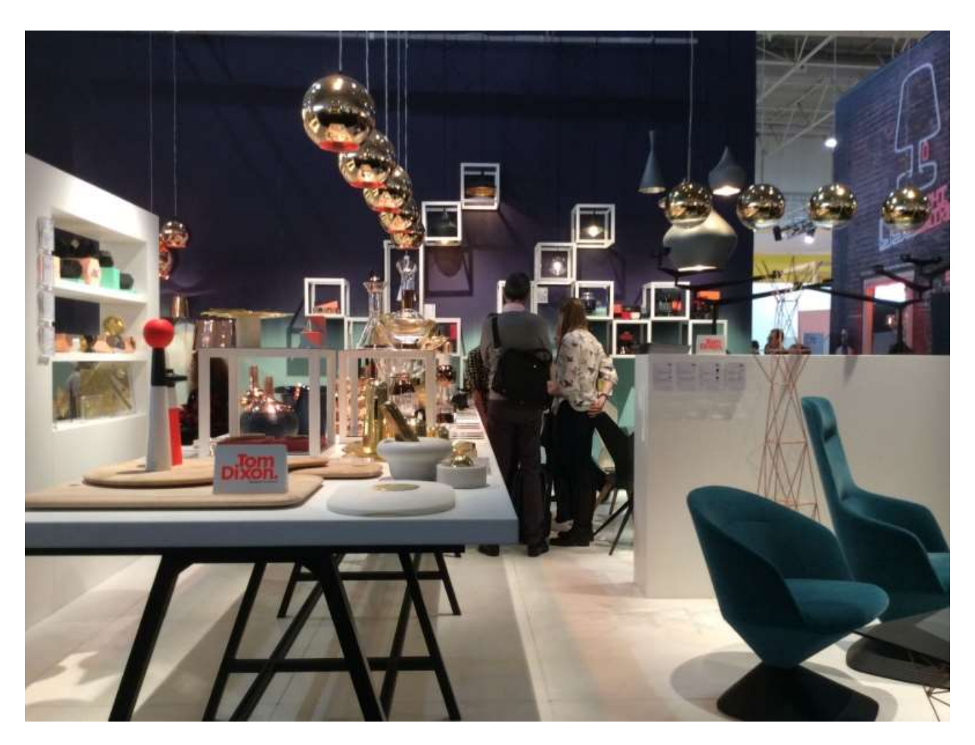
Maison & Objet' s goals are to present the best products in decoration and home interior solutions according to style. The Objet area is responsible for presenting the best objects and decorative accessories that are also displayed by product category. Every year, in January and September, Paris is surrounded by art and design.