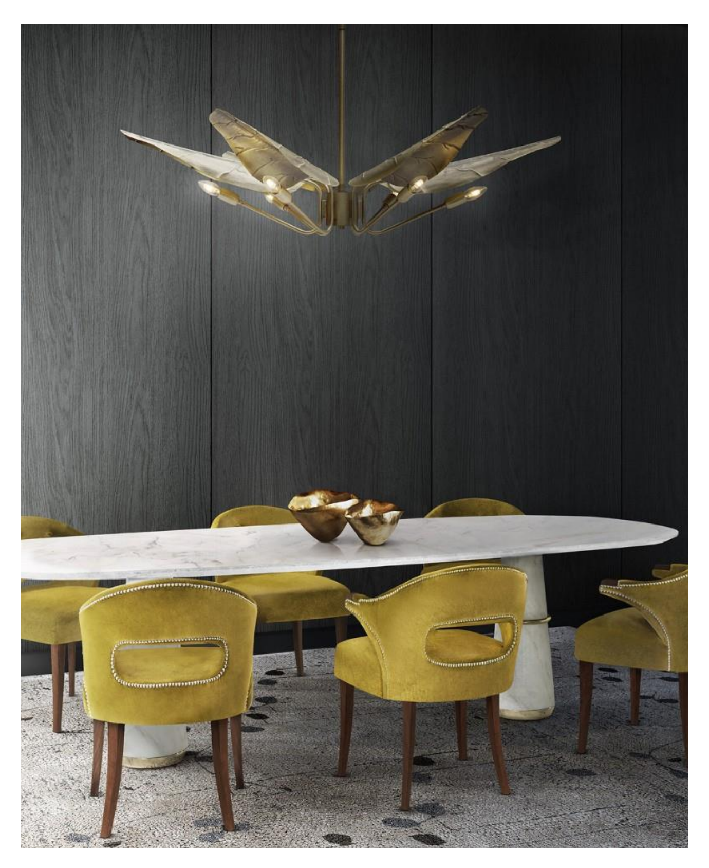
The final touch to your living room decor is the <u>NANOOK</u> dining chair. Nanook is the master of bears, the one who decides the luck of the hunters in the Arctic regions.