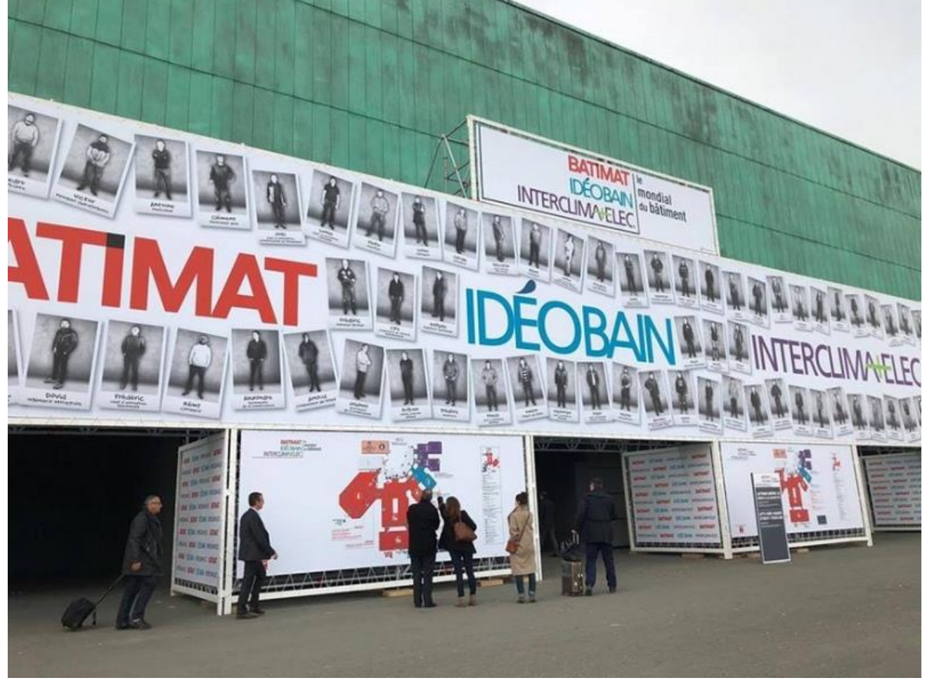
Hosted at the Paris Nord Villepinte Exhibition Center, Ideobain 2019 is one of the biggest references in the bathroom design industry that allows the installers and specifiers to find all of the best product solutions for their incredible bathroom projects.

SEE ALSO: TAKE A LOOK AT THE BEST PRODUCTS FROM DECOREX 2019