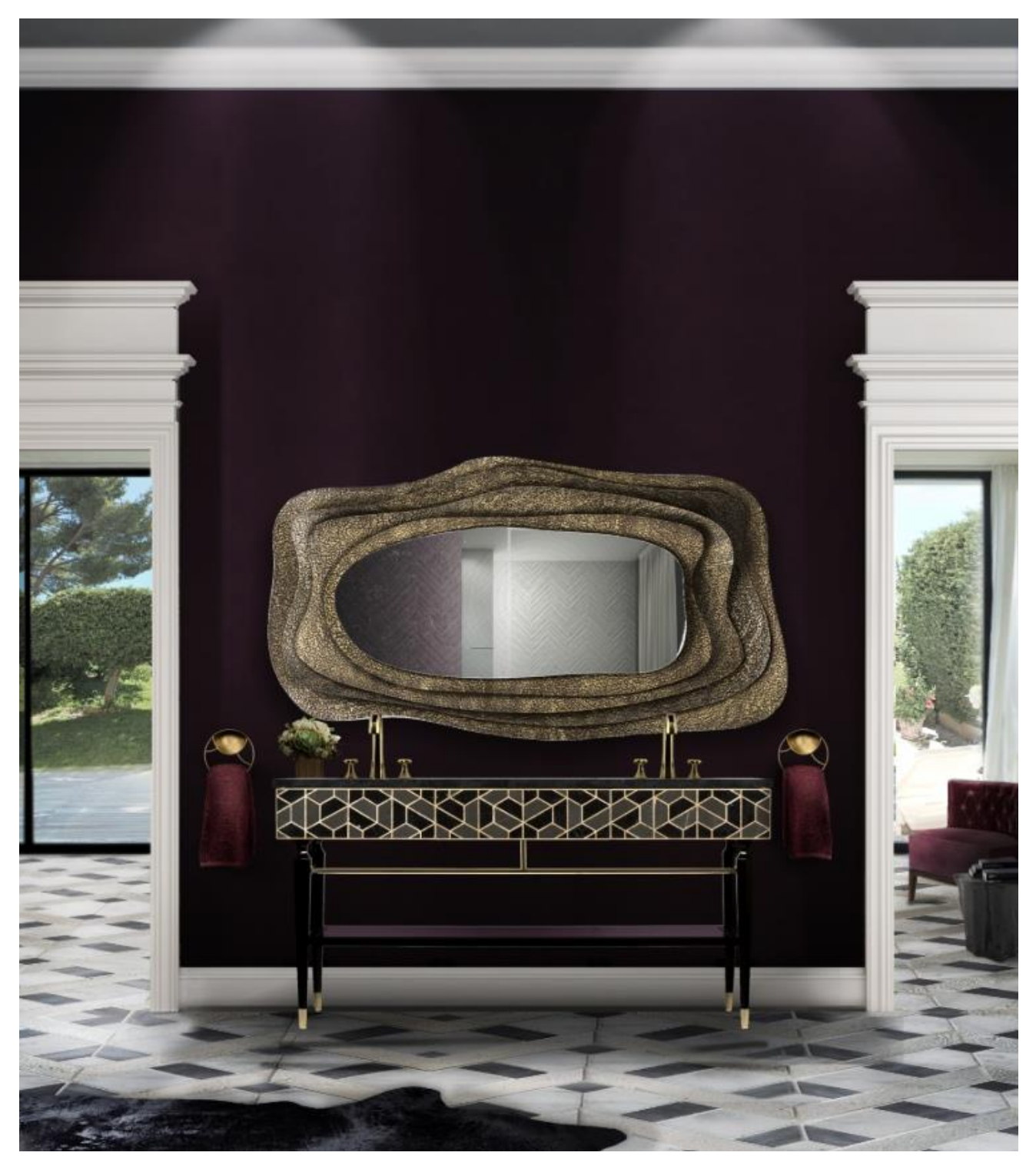
Don't miss the chance to see live at Cersaie these beautiful handmade products with a variety of materials, fabrics, and colours, able to give wings to the most inspirational ideas.