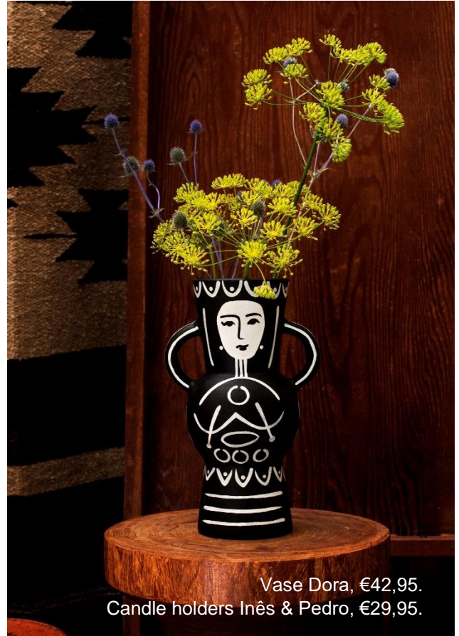
Vase Dora, €42,95. Candle holders Inês & Pedro, €29,95.