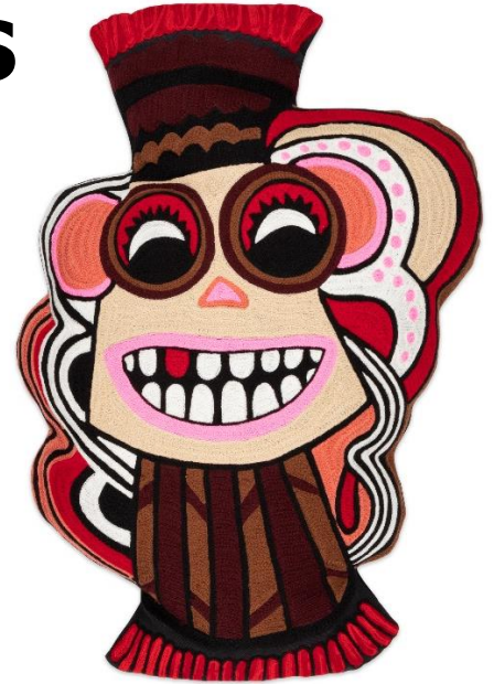
Pillows Tooth, Lips & Mask, embroidered, €49,95.

An exciting new international collab: Kitsch Kitchen X Paris Essex, the illustrious French-English textiles duo that became famous with their literally fantastic creations in primary, neon and pastel colours.