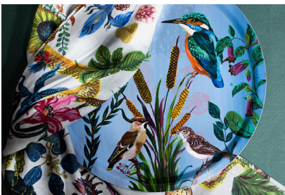
Birds in the Dunes