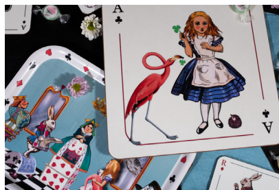
Alice in Wonderland