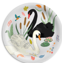
Swan Lake Mini Tray