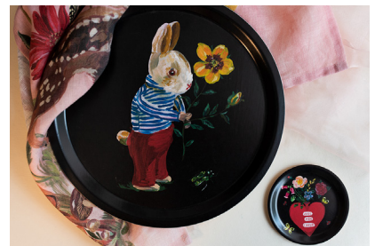
In the Garden of my Dreams