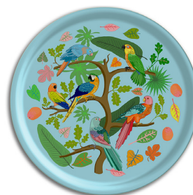
Parrots Round Tray