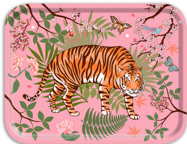
Panthera Large Tray