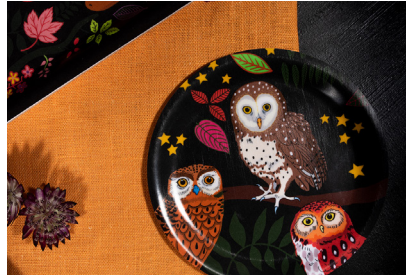
On The Wild Side