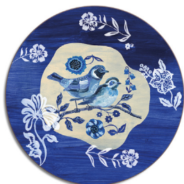
A Pair of Stonechats Placemat