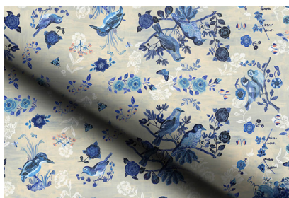
The Blue Story Fabric