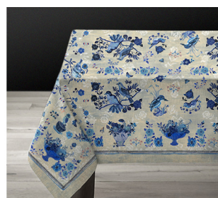
The Blue Story Tablecloth