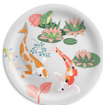
Water Lily Pond Mini Tray