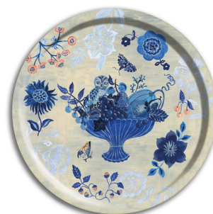
The Blue Story Round Tray