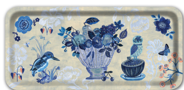
The Blue Story Tray