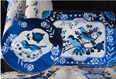
The Blue Story