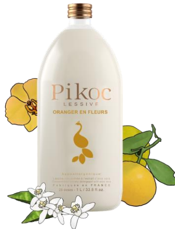
Oranger en Fleurs