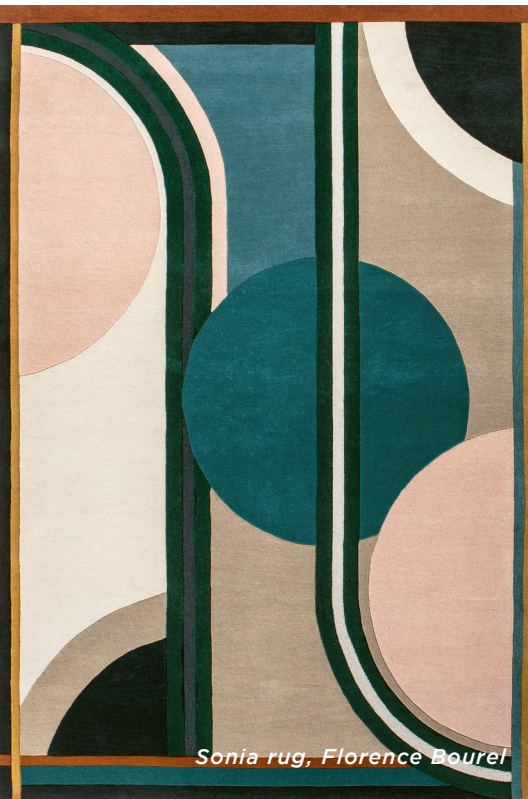
Sonia rug, Florence Bourel

Through its wide range of colours, Toulemonde Bochart personalises all interiors: pastel and neutral colours in a bohemian spirit, and bright colours for a more retro atmosphere.