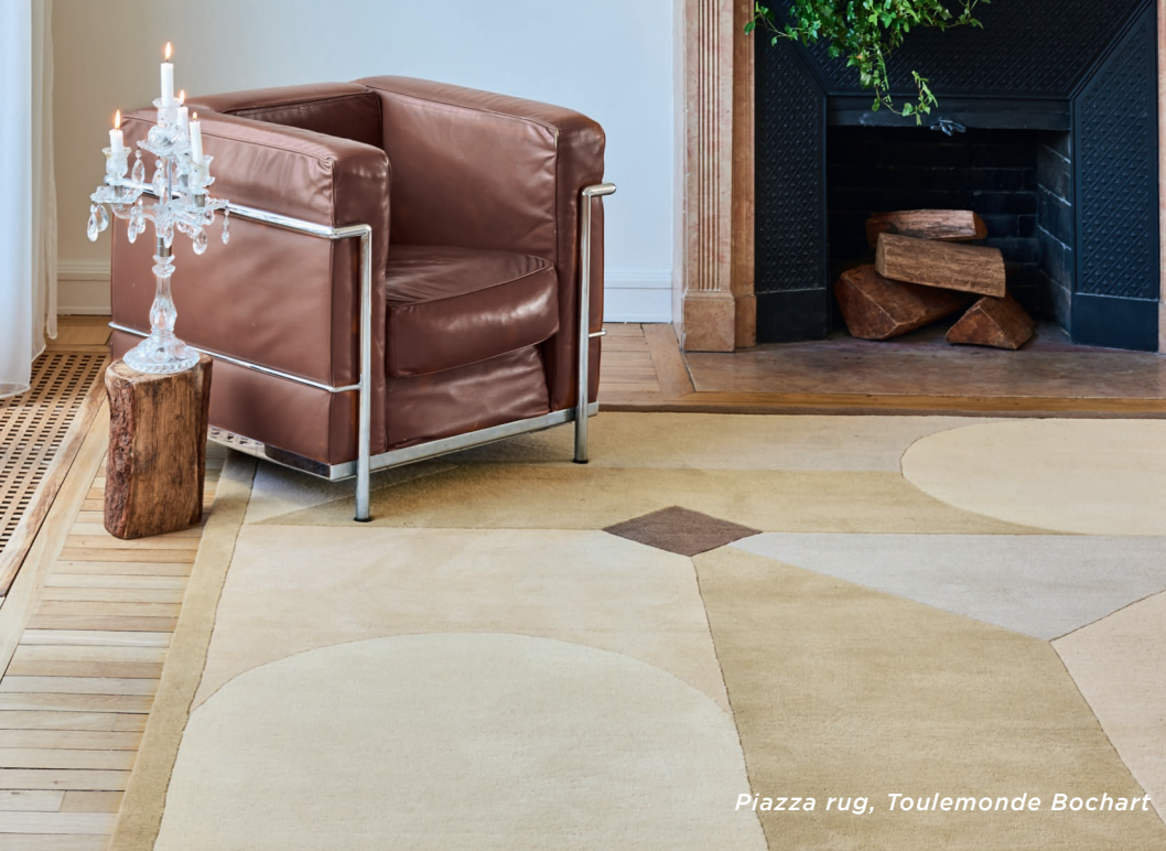
Piazza rug, Toulemonde Bochart