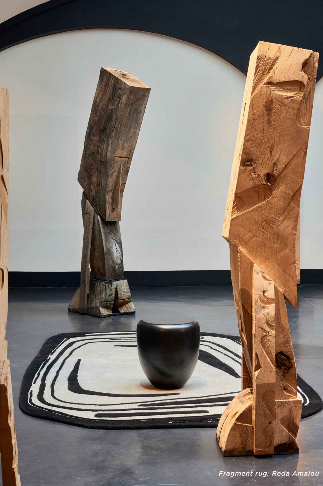
Fragment rug, Reda Amalou