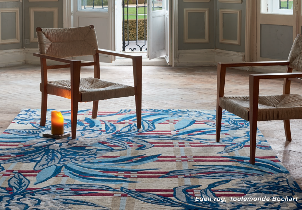
Eden rug, Toulemonde Bochart