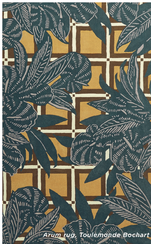
Arum rug, Toulemonde Bochart