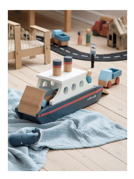
Sebra wooden ferry RRP 129,95 € / 114,95 £ / 949 SEK