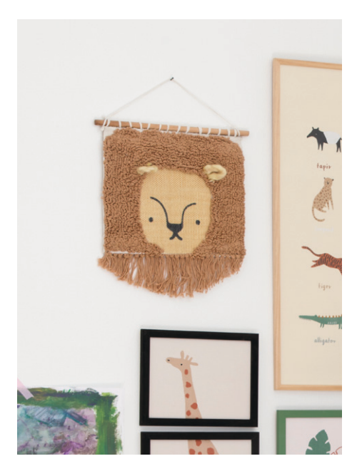
Woven wall hanging, Wildlife, Lee the lion RRP 29,95 \ensuremath{\mathbb{C}} / 26,95 \ensuremath{\mathbb{E}} / 279 SEK