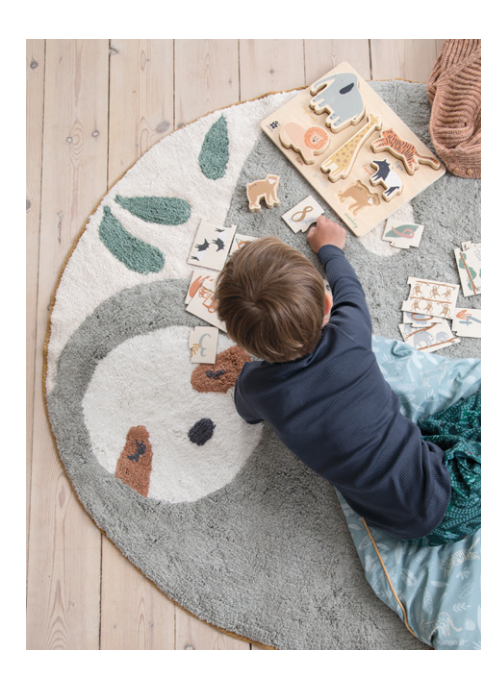
Woven floor mat, Lacey the sloth RRP 99,95 € / 89,95 £ / 799 SEK

DISCOVER OUR NEW AW19 COLLECTION AND THE THEME WILDLIFE AT THE UPCOMING FAIRS: