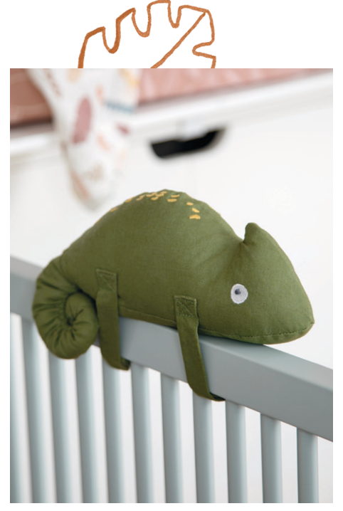
Musical pull toy, Carley the chameleon, moss green RRP 42,95 \ensuremath{\in} / 38,95 \ensuremath{\pounds} / 399 SEK