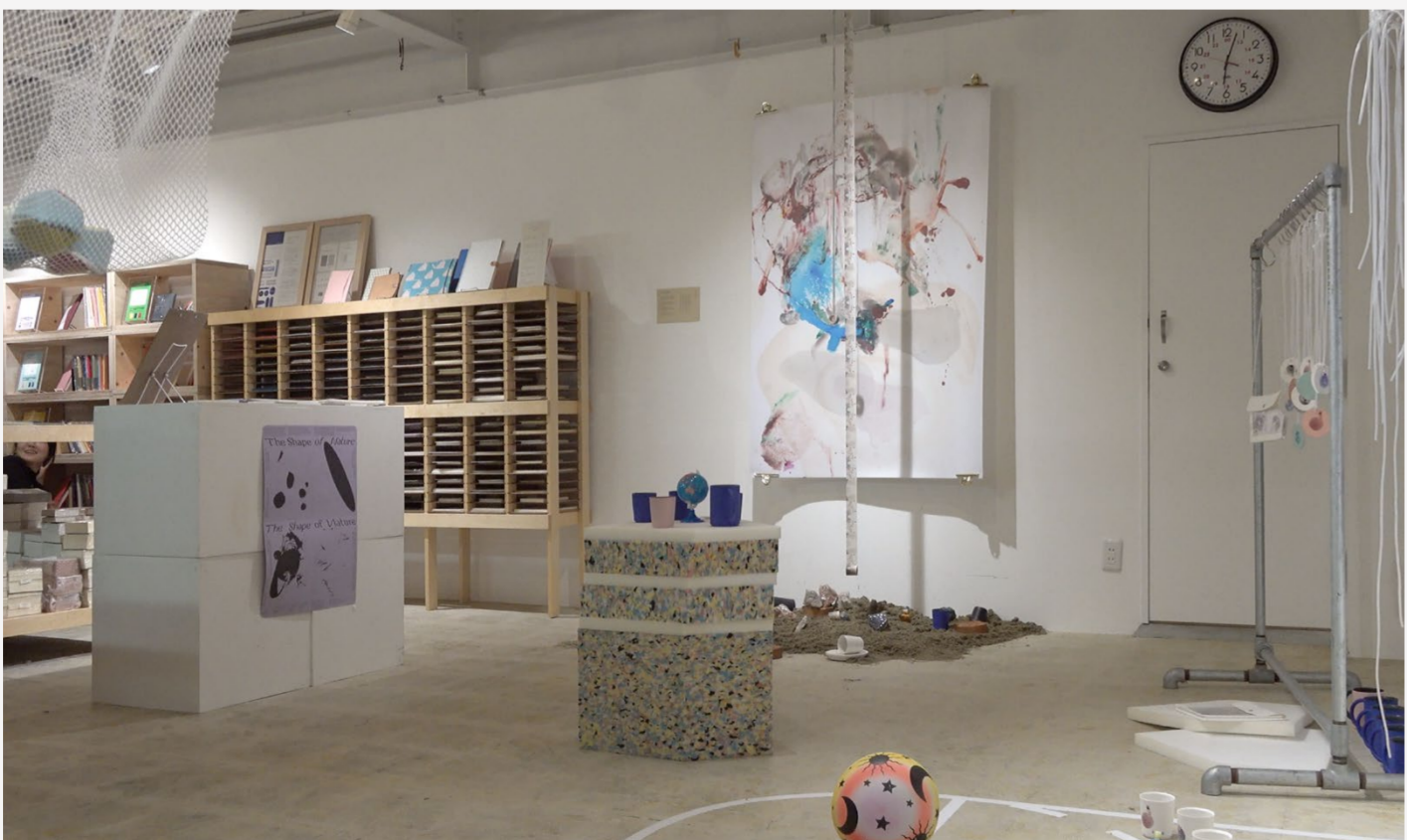
Ye-seul Choi with Hightide

A variety of artworks & products created by the nature of all