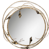
STELLA | MIRROR