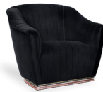
MIA | CHAIR