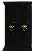
PARISIAN | ARMOIRE