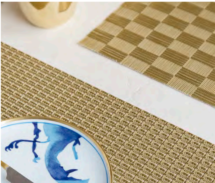
GOLD, Domino, Trellis