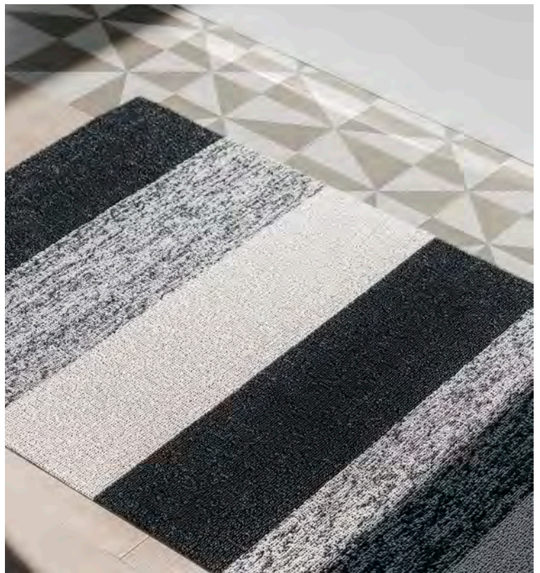
SALT & PEPPER, Marbled Stripe Shag

New to the range of Shag floor mats is Marbled Stripe . Two distinct solid colors come together to form a heathered middle ground in this tufted, vinyl-backed mat, which is available in four sizes. The doormat version is a horizontal tricolor that is doubled for the big mat (6 stripes), while the equally sized bands span the width of the utility mat (6 stripes) and runner (12 stripes). Marbled Stripe debuts in three colorways: Salt & Pepper, Bay Blue, and Ruby.