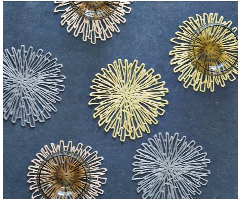
GILDED, GUNMETAL, PINK CHAMPAGNE, Bloom Coasters

Another new pressed design, Bloom , arrives in the form of coasters. Combining the organic exuberance of a chrysanthemum head, the graphic refinement of a contour line sketch, and a modern palette of metallic hues, Bloom is a fresh interpretation of florals. This flexible openwork accessory acts as a decorative base for drinks — or anything else that is placed on top.