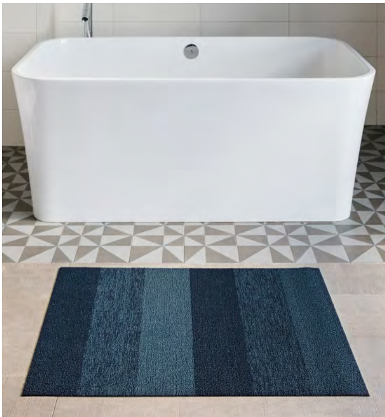
BAY BLUE, Marbled Stripe Shag