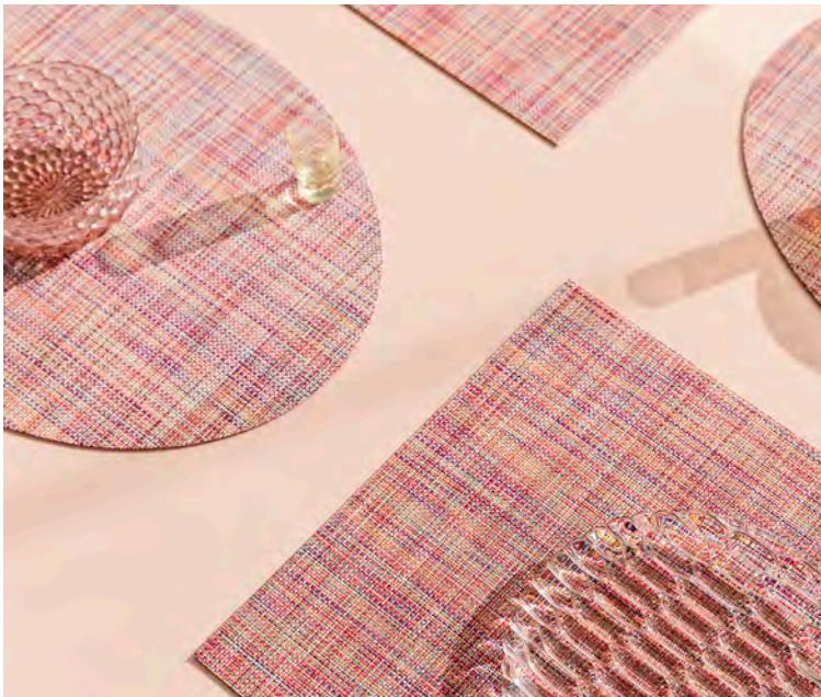
FESTIVAL, Mini Basketweave

The Fall/Winter 2019 collection also expands the palettes for a broad range of existing tabletop designs. New to the Basketweave range for tabletop is Chili — a bold, saturated red. Mini Basketweave gains dimension with vibrant yet versatile Festival as well as Cool Grey and Indigo.