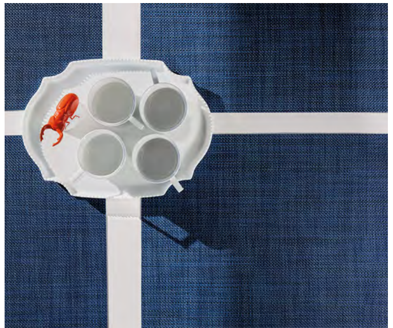
INDIGO, Mini Basketweave

The Fall/Winter 2019 collection also expands the palettes for a broad range of existing tabletop designs. New to the Basketweave range for tabletop is Chili — a bold, saturated red. Mini Basketweave gains dimension with vibrant yet versatile Festival as well as Cool Grey and Indigo.