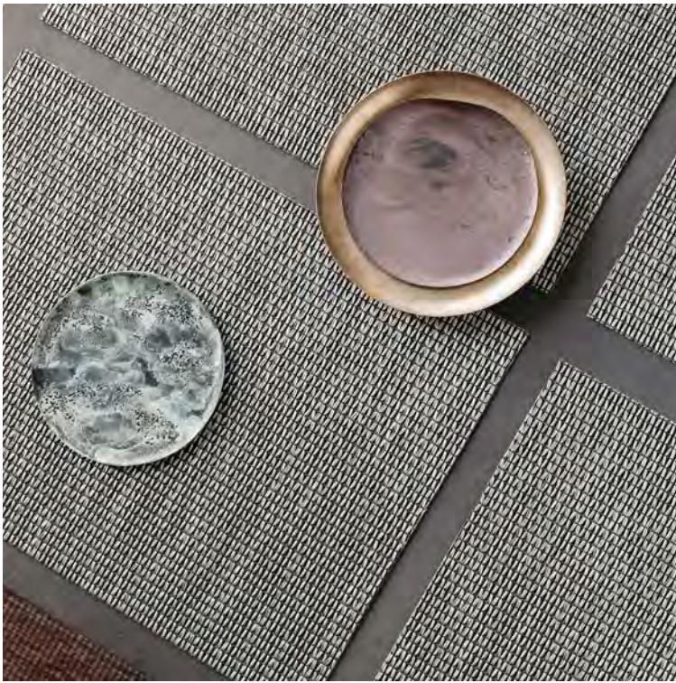
MICA, Wabi Sabi

(New York, NY – June 2019) Chilewich's Fall/Winter 2019 collection is at once striking and subtle, bringing together dynamic designs and colors as well as nuanced neutral hues and holiday-ready metallics that are refined enough for year-round use. The design-led, family-owned company's innovative new placemats, table runners, coasters, and floor mats offer novel ways to incorporate the beauty and functionality of Chilewich textiles into any space, indoors or outdoors.