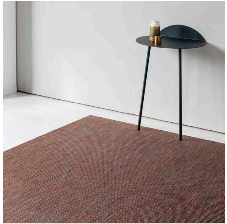
SIENNA, Wabi Sabi

Four new woven tabletop designs — Wabi Sabi , Prism , Domino , and Trellis — span a range of styles and scales. They are joined by Flora , an enchanting printed placemat, and two “pressed” introductions: Sea Lace placemats and Bloom coaster sets. Distinctive new colorways for Basketweave , Mini Basketweave , and Heddle add depth to existing weaves. For the floor, Wabi Sabi and Prism debut as woven mats, and Marbled Stripe joins the range of tufted Shag mats.