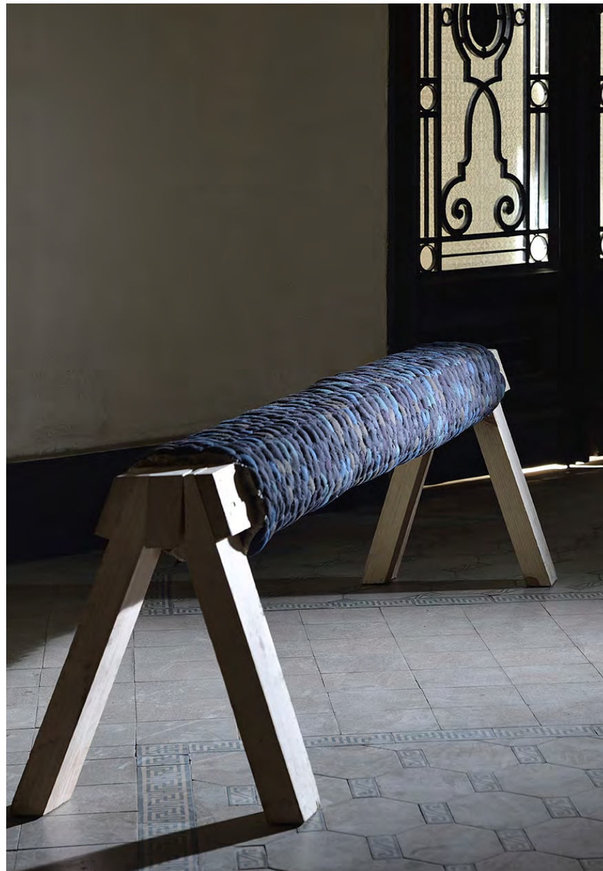
raw wood seats and hand stitched upholstery with cotton fiber filling - collection Naguib - design: Nathanaël Abeille et Samuel Aden More on Naguib collection > www.takecaire.com/naguib.html