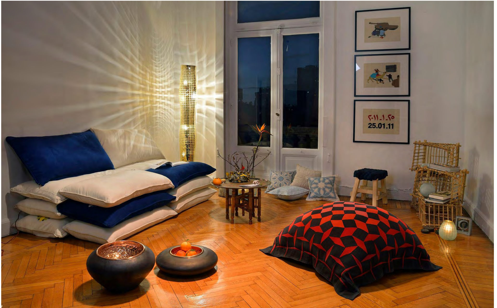
View from the gallery : TakeCaire' products issued from the first workshop – To see all the products click here > www.takecaire.com/products.html