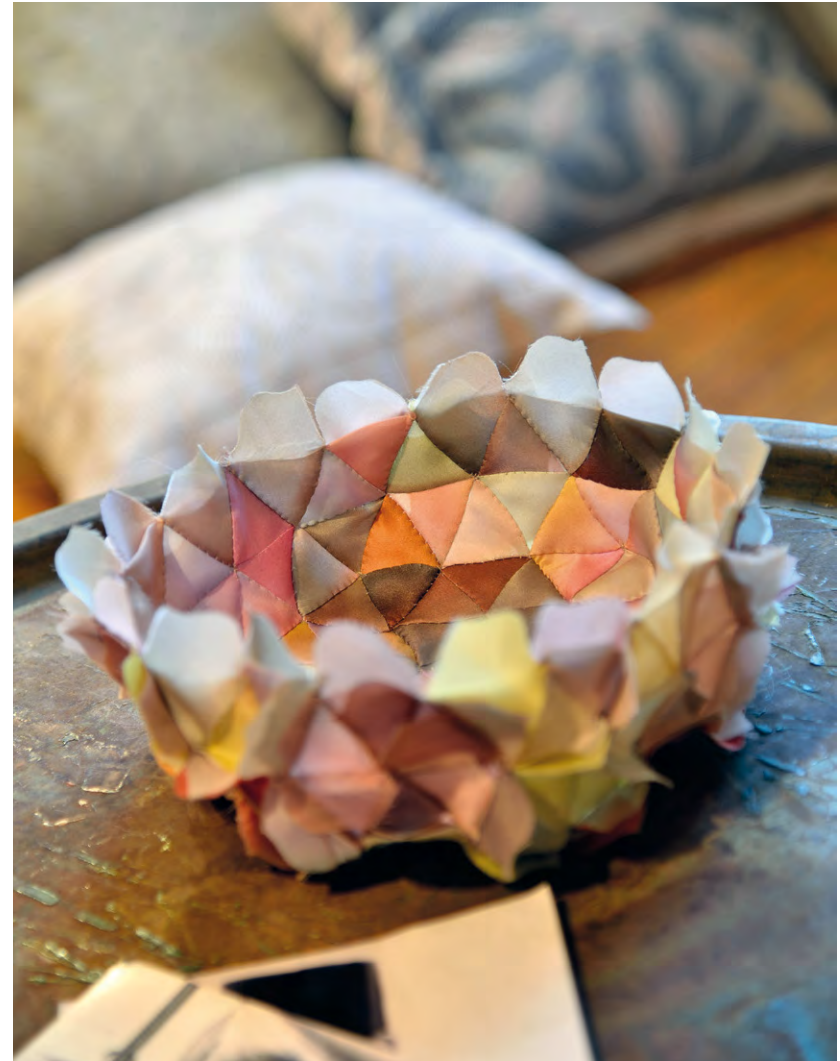
Hand stitched cup in silk organza – Heba collection Design: Nathanaël Abeille - Explore >www.takecaire.com/heba.html