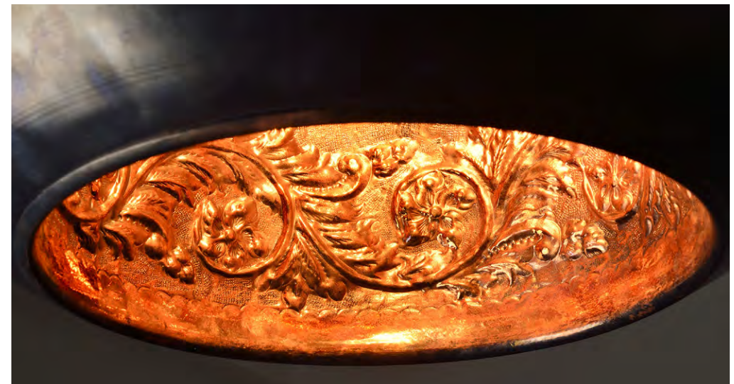
Drawings and detail picture of "Mystère" pendant lighting in repoussé copper.

work, men and women alike. In line with these values, TakeCaire has forged a partnership with the Association of the Protection of the Environment (APE), a local association benefiting and supporting Cairo's garbage collecting community, the Zabaleen; the initiative's programs create jobs and income for women making handmade products using recycled material, this includes weaving, making paper, knitting and other crafts.