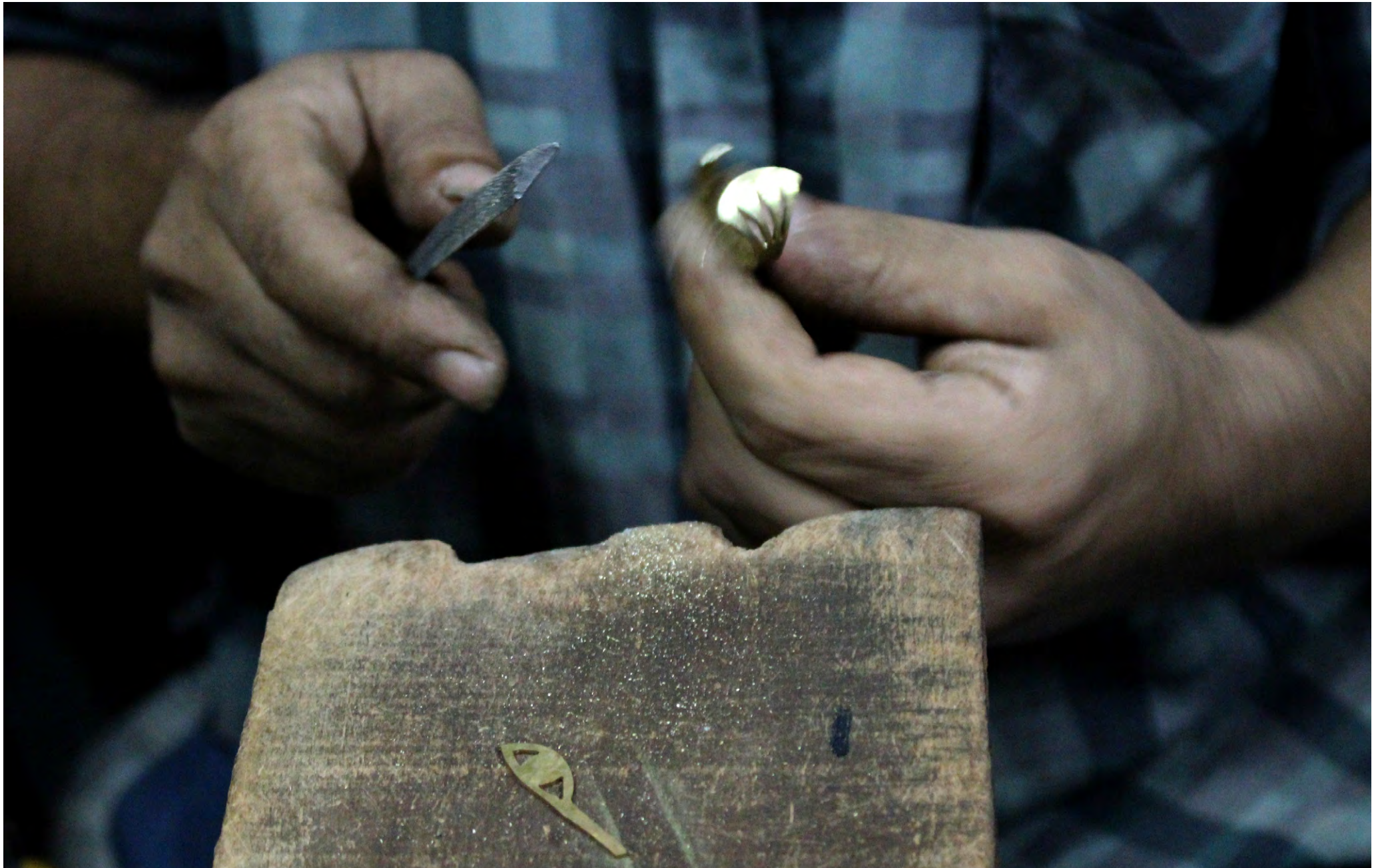
Inside the workshop of Arabi Farouk, finishing work on copper jewels from the Lotus collection. Design: Lola Mercier