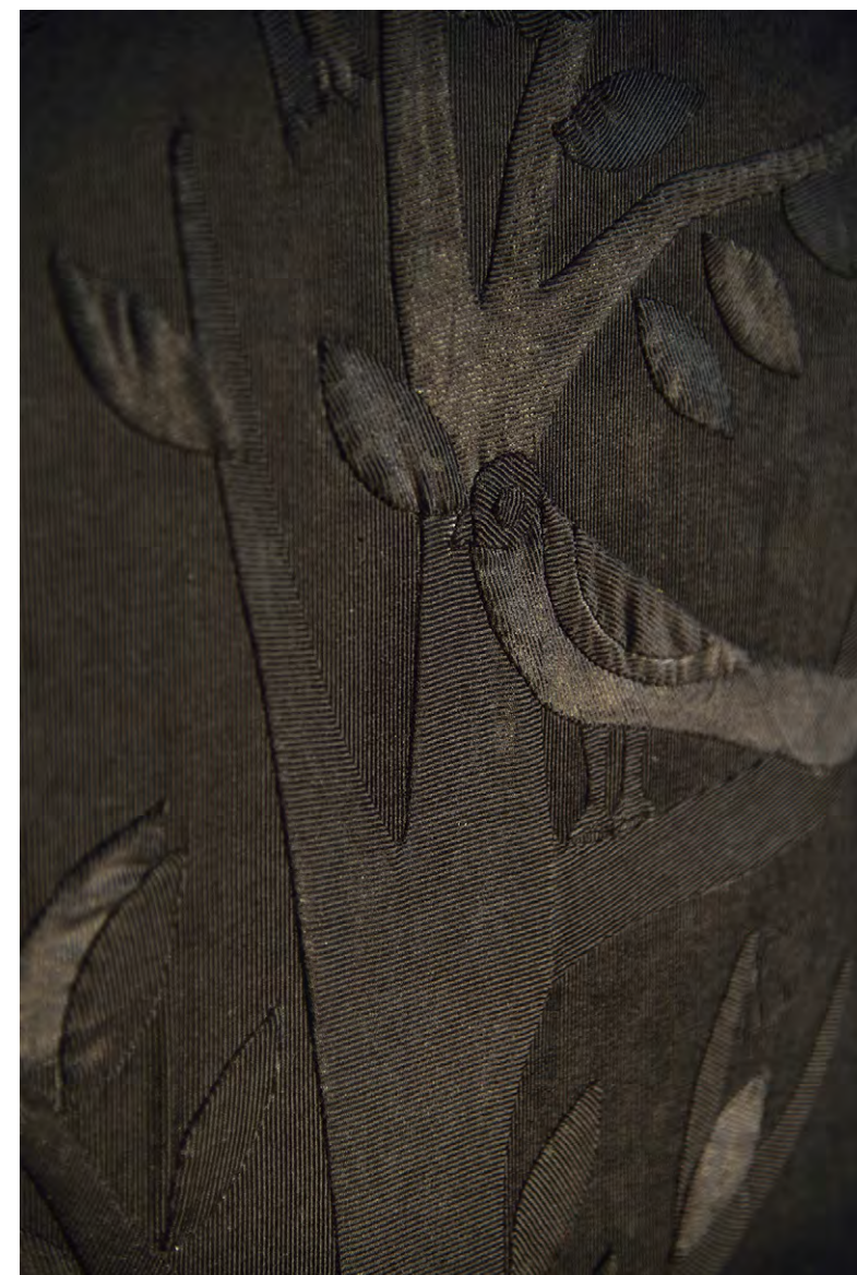
Black Wall" folding screen - khayameya, traditional tone on tone applique technique More on the folding screen and the Revolution collection > www.takecaire.com/furniture.html