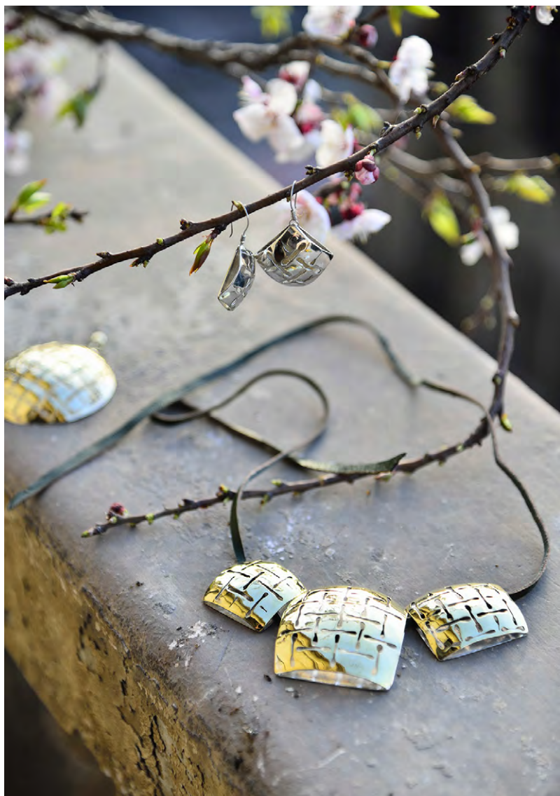
Fragments Jewelry collection: This is Bombé Design : Léo Lescop more jewellery > www.takecaire.com/jewellery.html