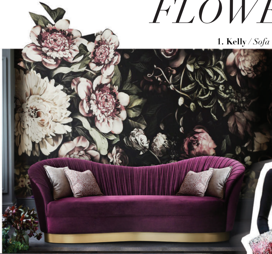
1. Kelly / Sofa