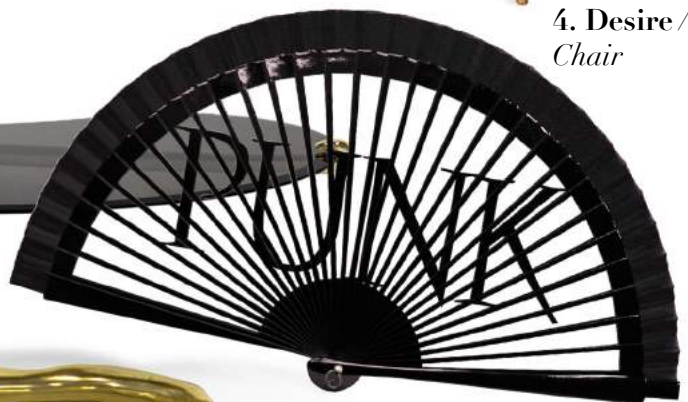
Fan "Punk" olivier-bernoux-shop.com