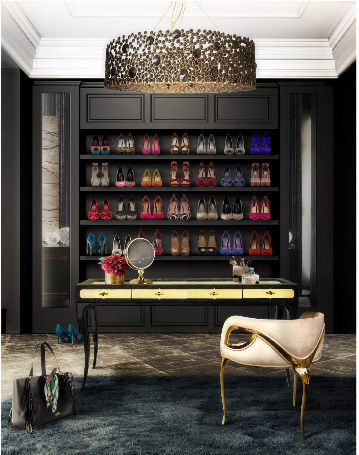
10. Eternity III / Chandelier 11. Exotica / Dressing Table 12. Chandra / Chair