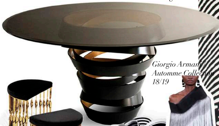
Giorgio Armani Automme Collection 18/19