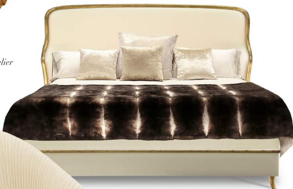
2. Forbidden II / Bed