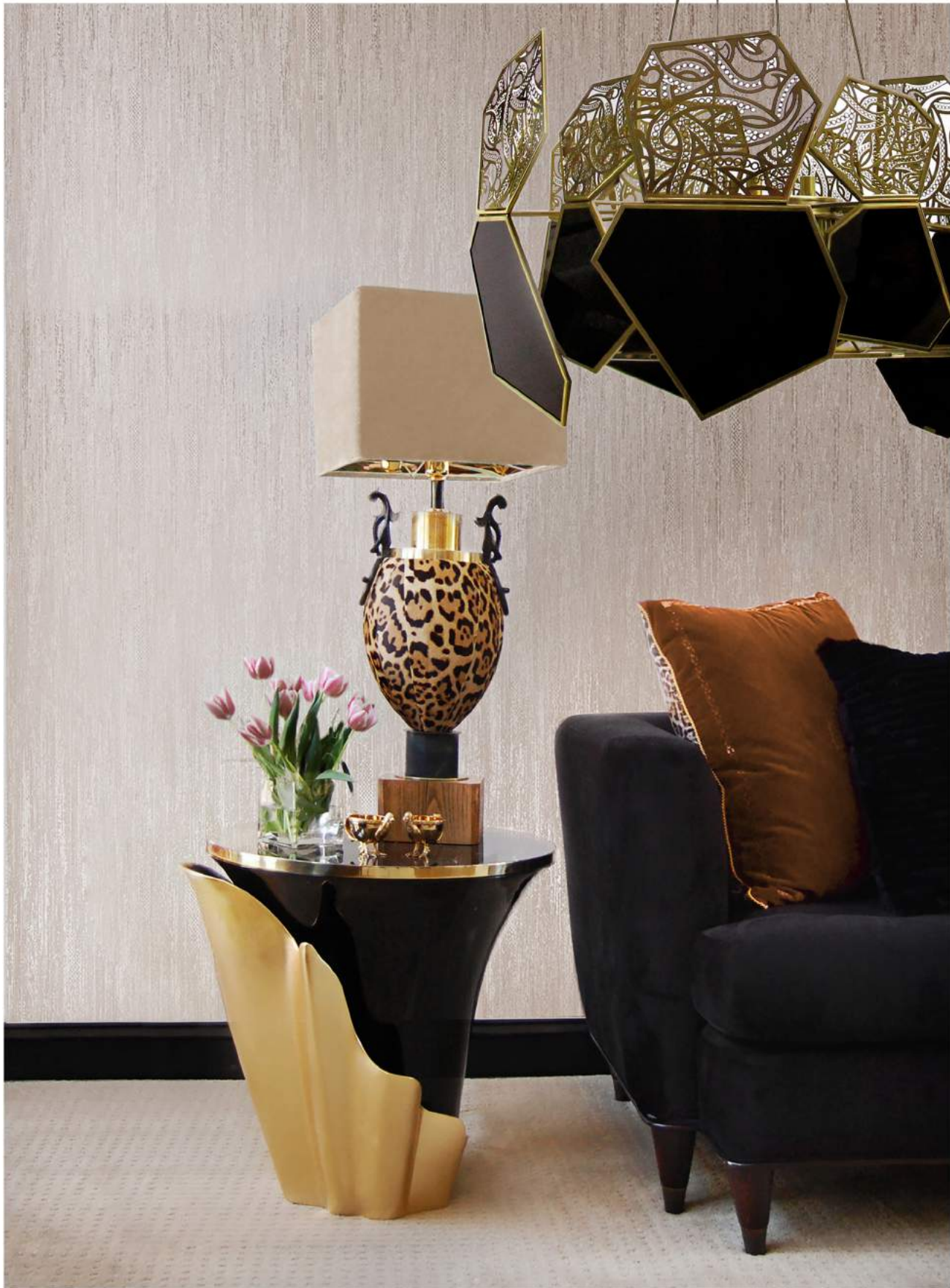
6. Hypnotic / Chandelier