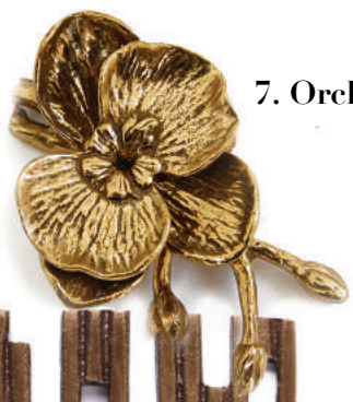
7. Orchidea Flower / Applique