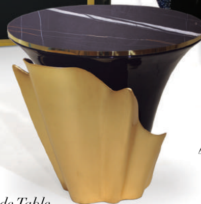
3. Yasmine / Side Table