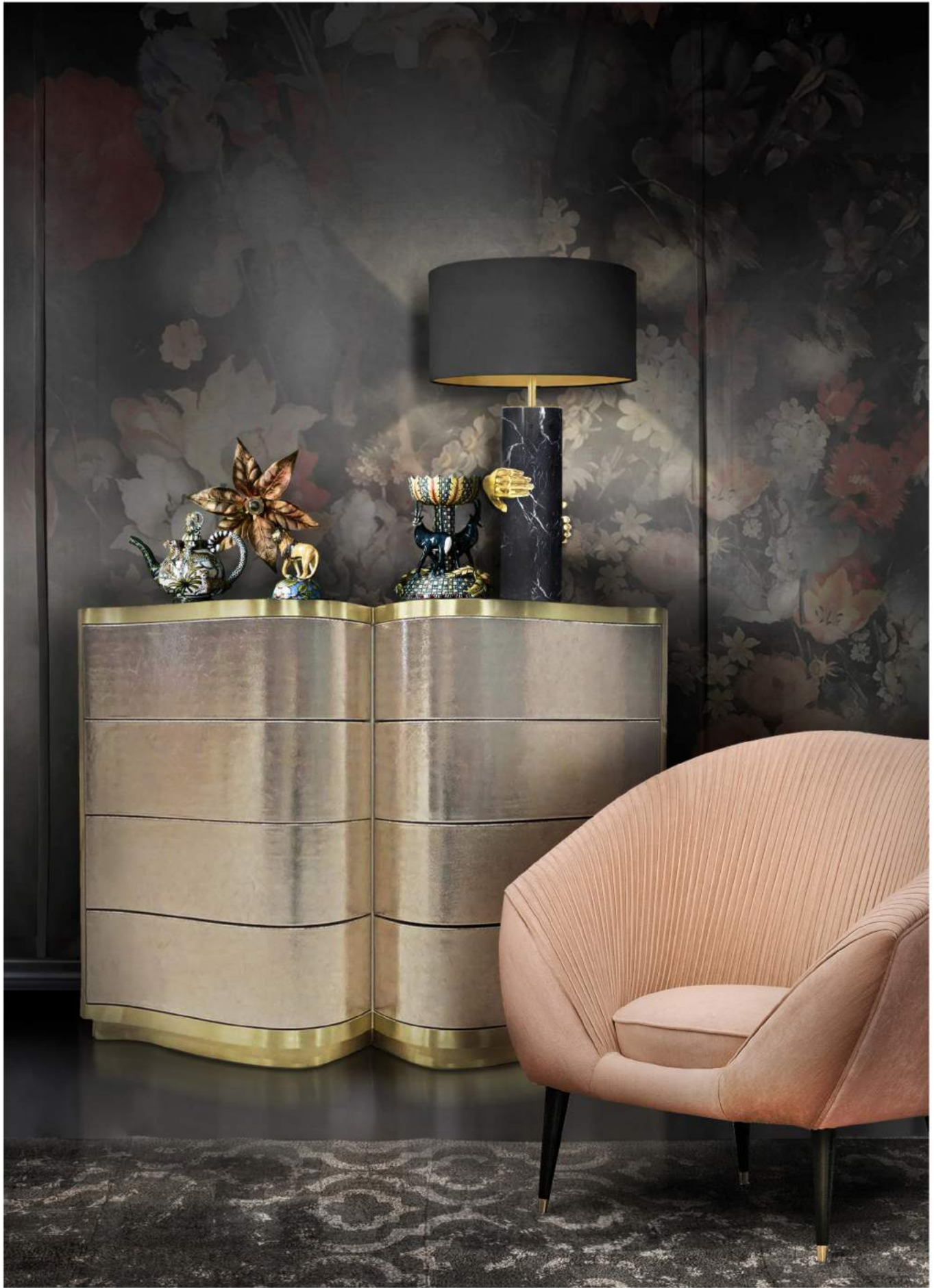
7. Vengeance / Table Lamp 8. Poem / Chest 9. Audrey / Chair