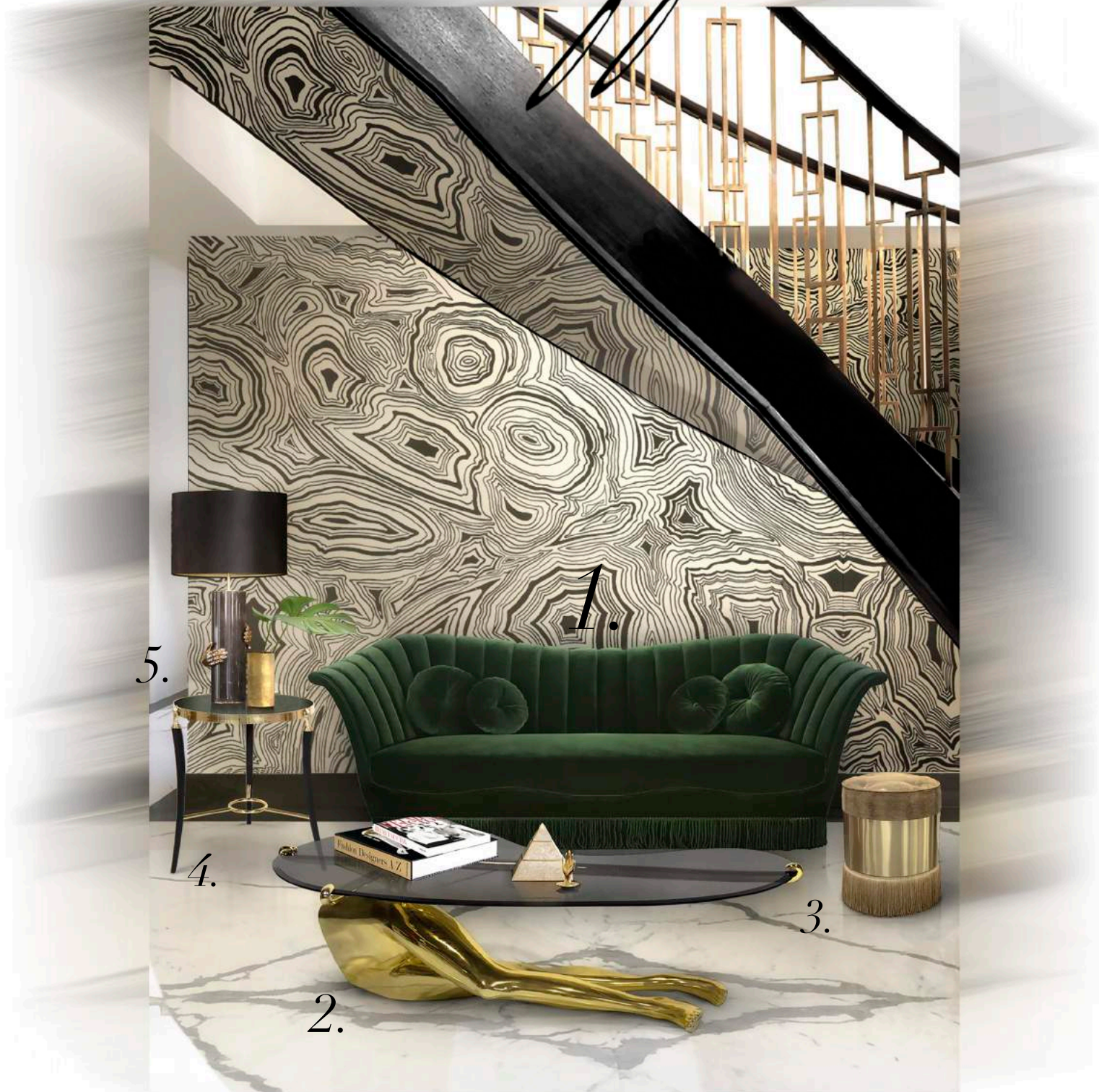
1. Caprichosa II / Sofa 2. Tabu / Cocktail Table 3. Olivia / Stool 4. Gisele / Side Table 5. Vengeance / Table Lamp