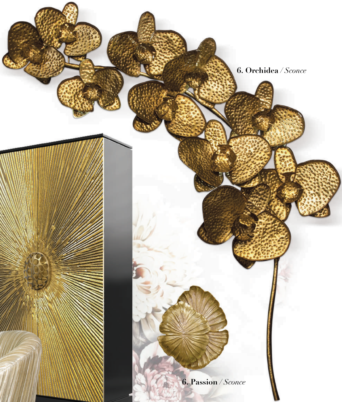
6. Orchidea / Sconce