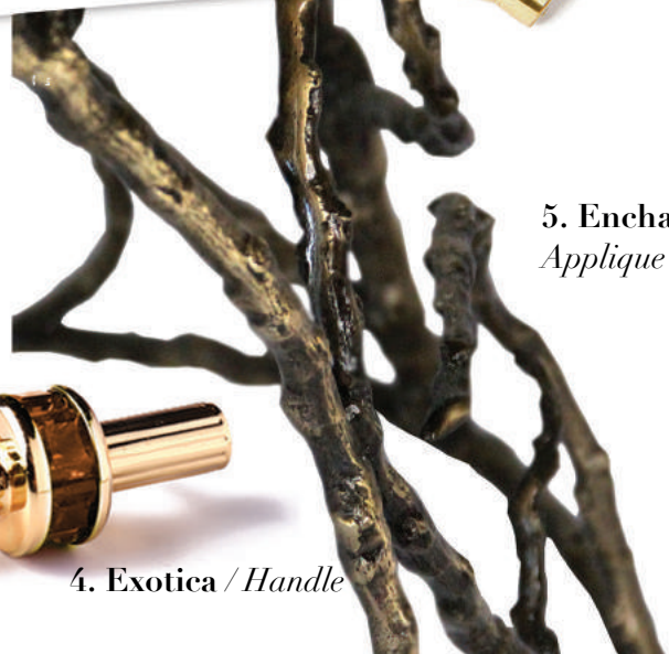
4. Exotica / Handle