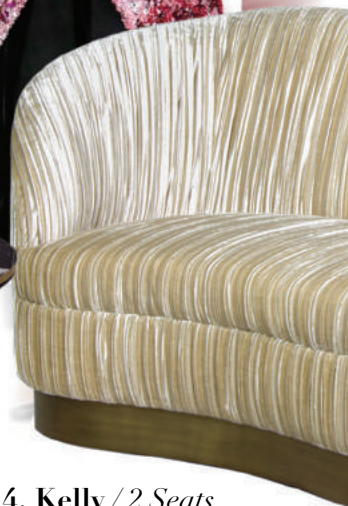
4. Kelly / 2 Seats