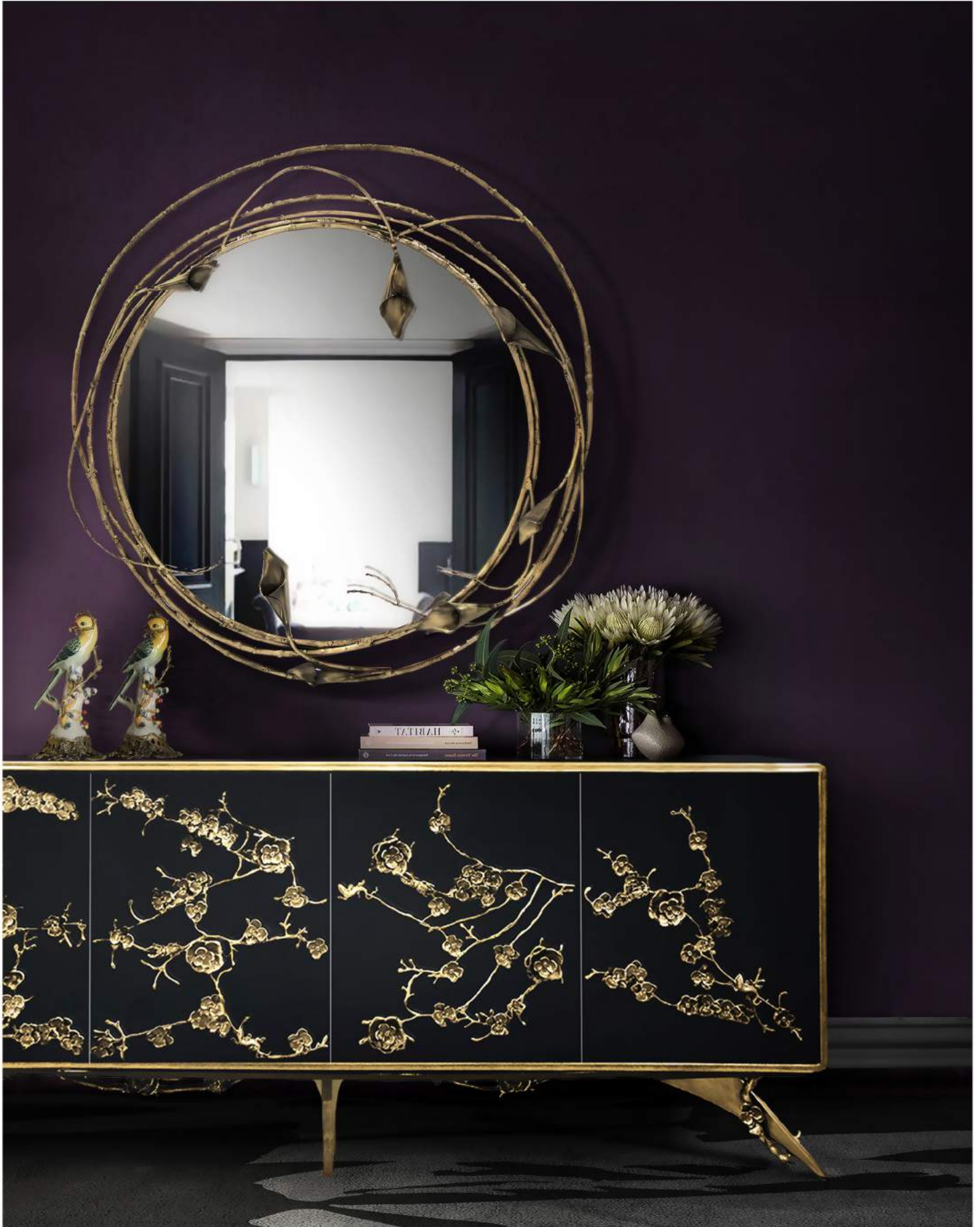
4. Stella / Mirror