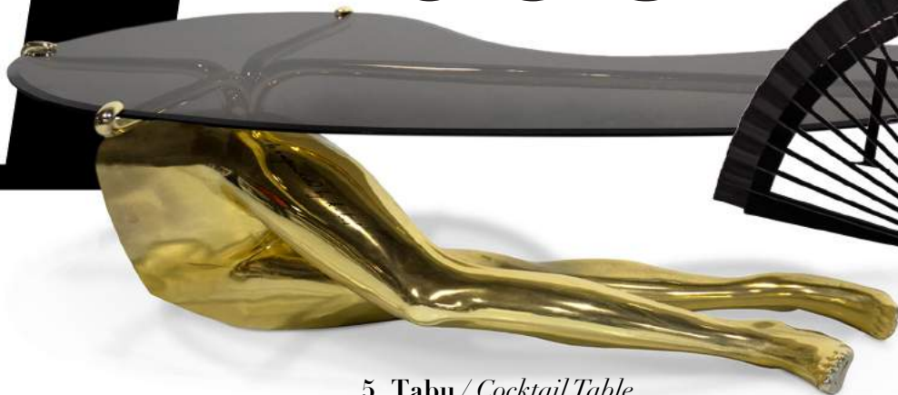
5. Tabu / Cocktail Table