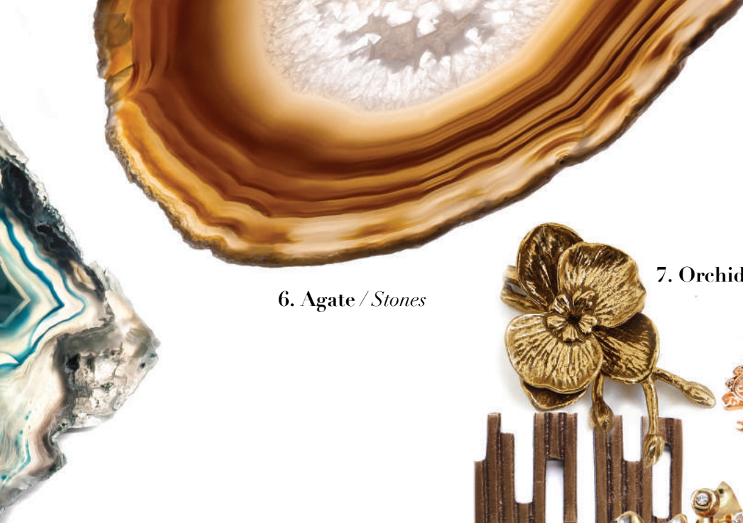
6. Agate / Stones