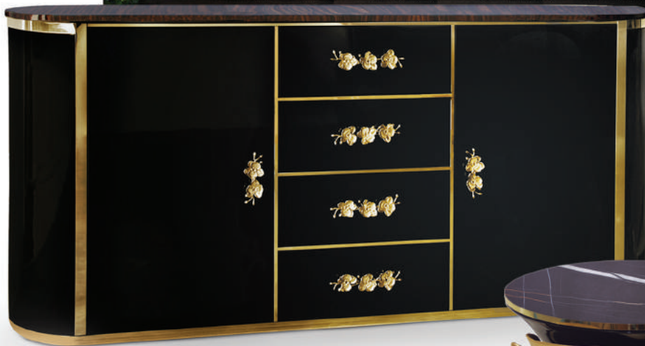
2. Orchidea / Chest