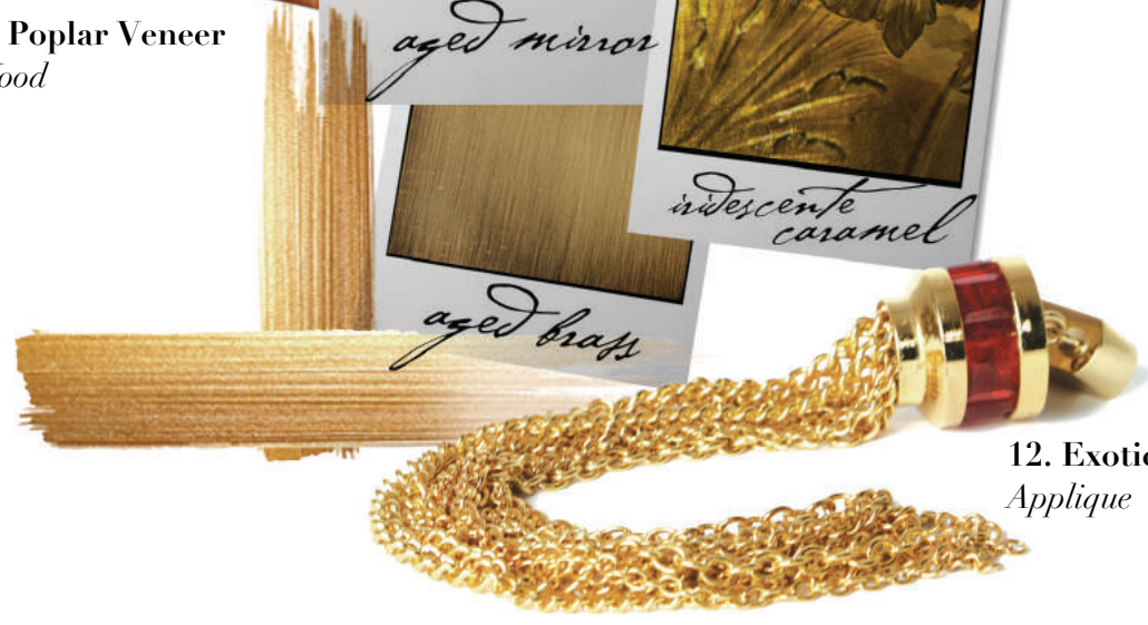
12. Exotica / Applique