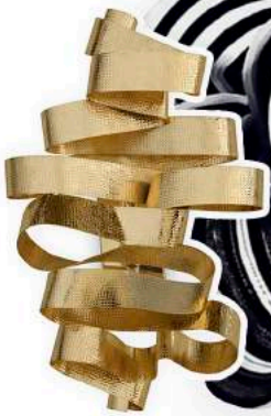
7. Chloe / Sconce