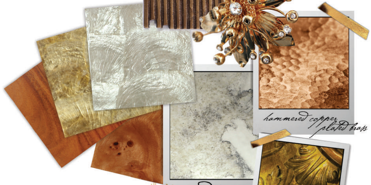
hammered copper plated brass