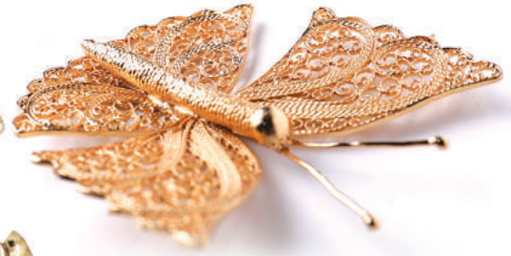
8. Nymph Butterfly / Applique