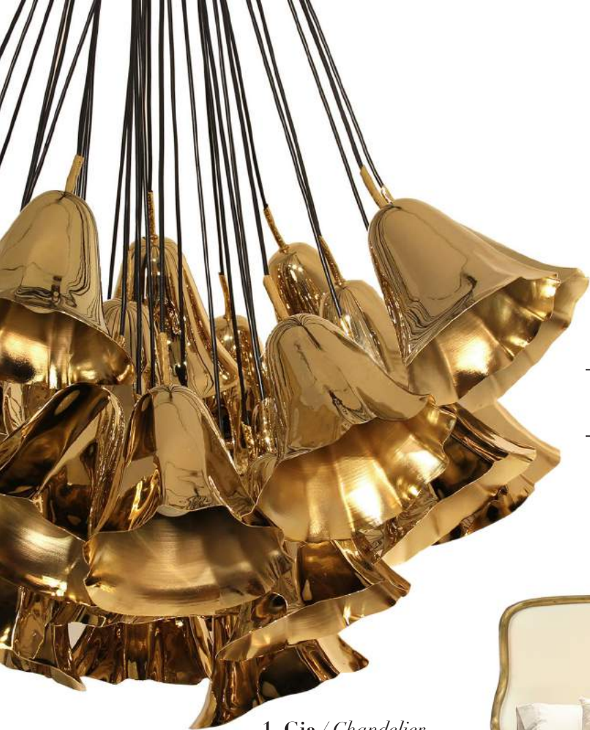
1. Gia / Chandelier