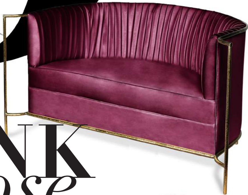
4. Desire / Chair

Sexy rebellion emanates with fierce femininity as soft pinks and bold mauves mesh with striking blacks and lustrous metal curves and angles.