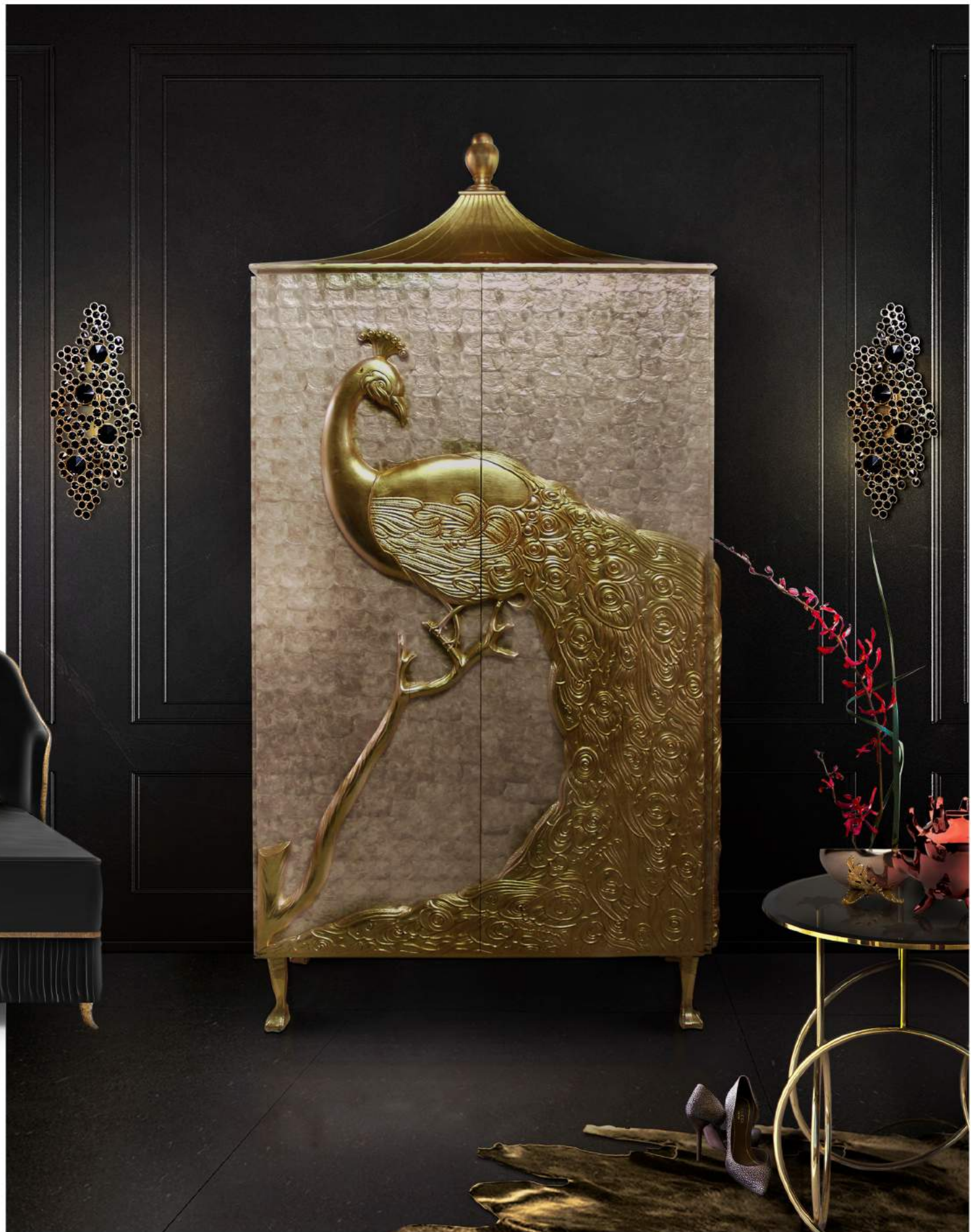
10. Eternity / Sconce 11. Camilia / Armoire 12. Kiki / Side Table