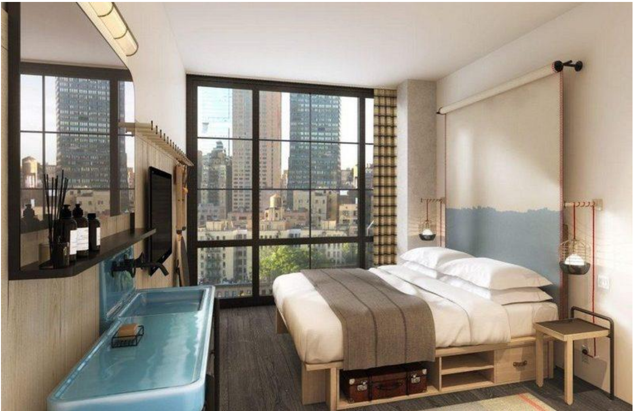
Yabu Pushelberg