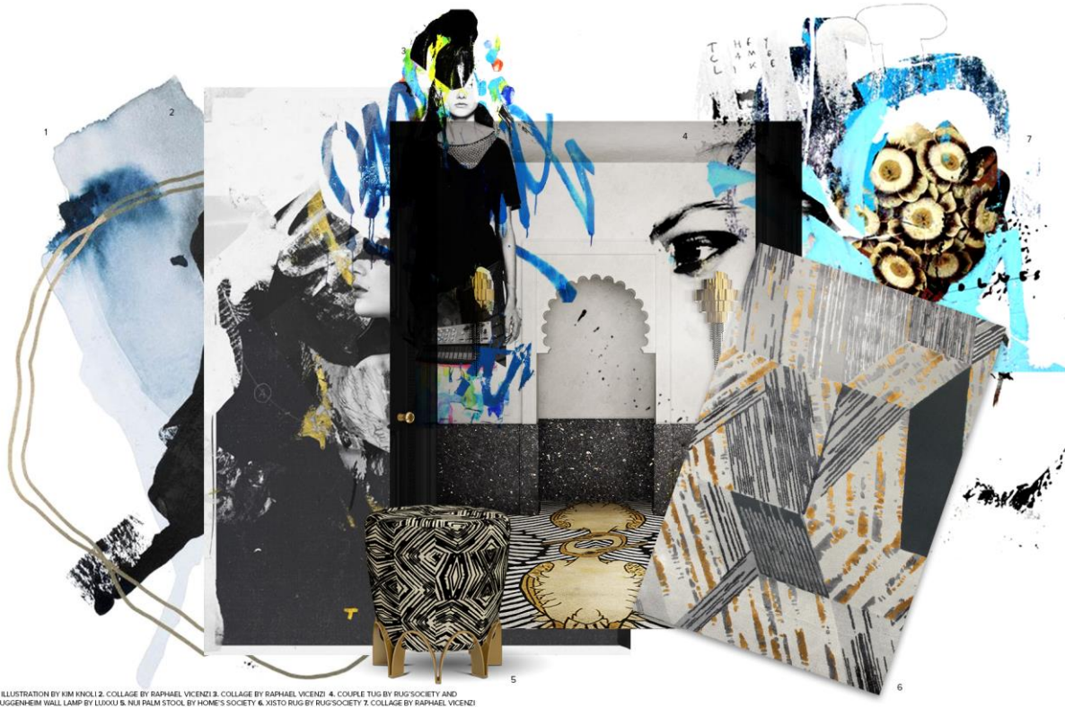
1. ILLUSTRATION BY KIM KINOL 2. COLLAGE BY RAPHAEL VICENZI 3. COLLAGE BY RAPHAEL VICENZI 4. COUPLE TUG BY RUGSOCIETY AND GUGGENHEIM WALL LAMP BY LUXOU 5. NUI PALM STOOL BY HOME'S SOCIETY 6. XISTO RUG BY RUGSOCIETY 7. COLLAGE BY RAPHAEL VICENZI

No matter the collection, Jonathan Adler, always brings his signature style – pieces featuring bold graphics, pops of color, textural patterns, and eye-catching details. Adler covers everything necessary – from the large furniture pieces to the smallest of accents – or even a complete revamp of a boring room.