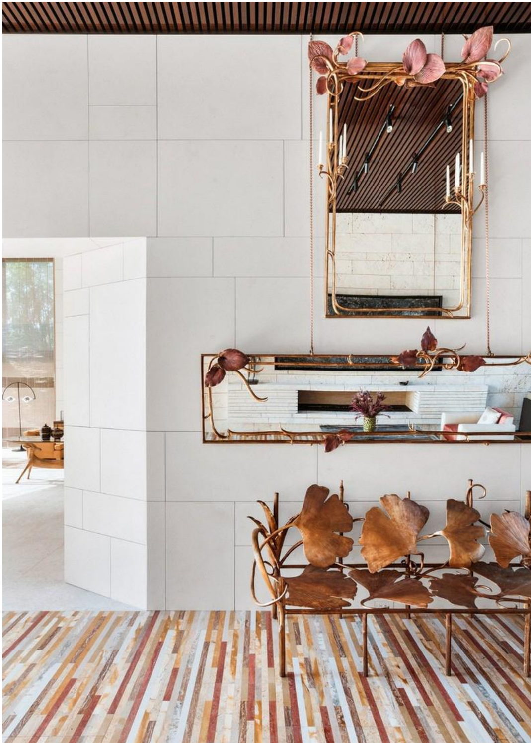
Peter Marino via Pinterest

Peter Marino is one of the top New York-based interior designers and architects famous for his irreverent and sophisticated approach to his projects. He founded his architecture company in 1978 and is widely acclaimed for having redefined modern luxury through a