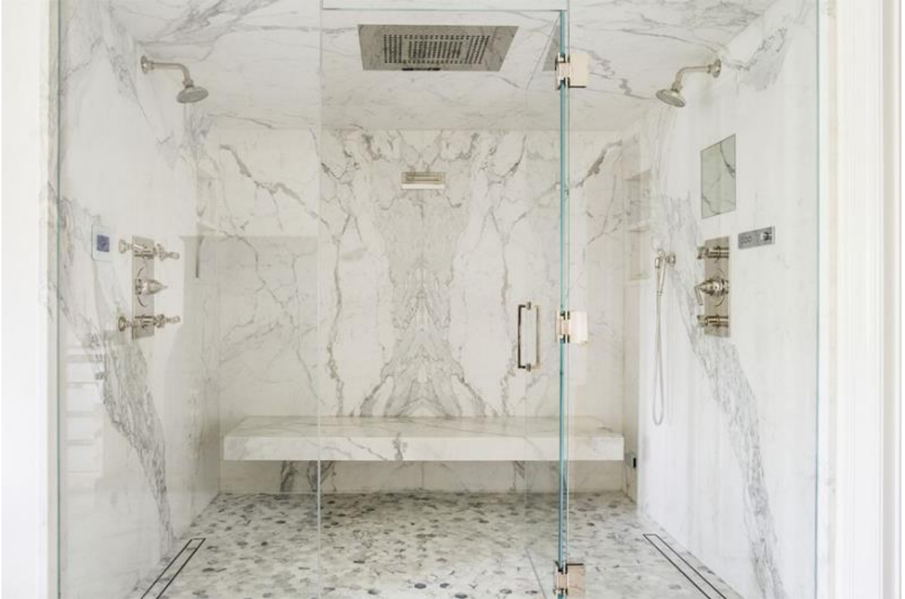
Nate Berkus

Interior designer, author, TV host, and television personality – this is all that defines Nate Berkus. This renowned American interior designer manages his Chicago interior design company 'Nate Berkus Associates'; has released numerous lines of products, authored several books, and helped lots of avid decor lovers into the do's and don't's of interior design trends.