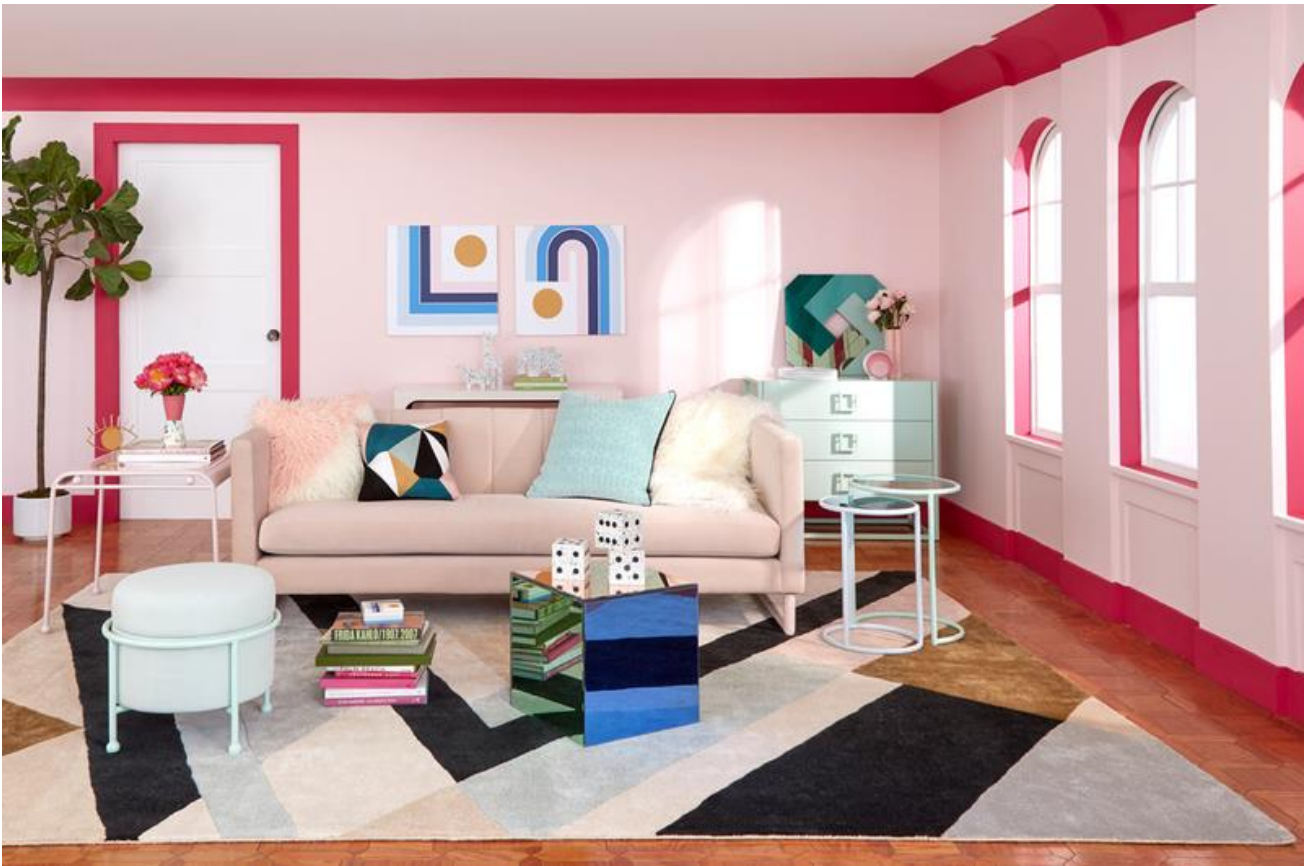
Jonathan Adler

Jonathan Adler is a New York-based interior designer that first launched his brand after leaving his day job to pursue his biggest love – pottery. Jonathan's biggest aim was to design pieces that help anyone building a flawlessly chic home. This led to more and more, and today you can find a huge variety of beautiful design trends (that still shape the industry) all created by him.