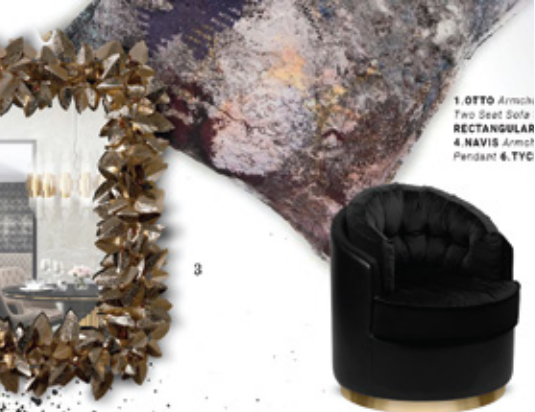
1. OTTO Armchair Two Seat Sofa RECTANGULAR 4. NAVIS Armchair Pendant 6. TYC

From velvets to matte finishes, the trends LUX XU selected are everything but conventional.