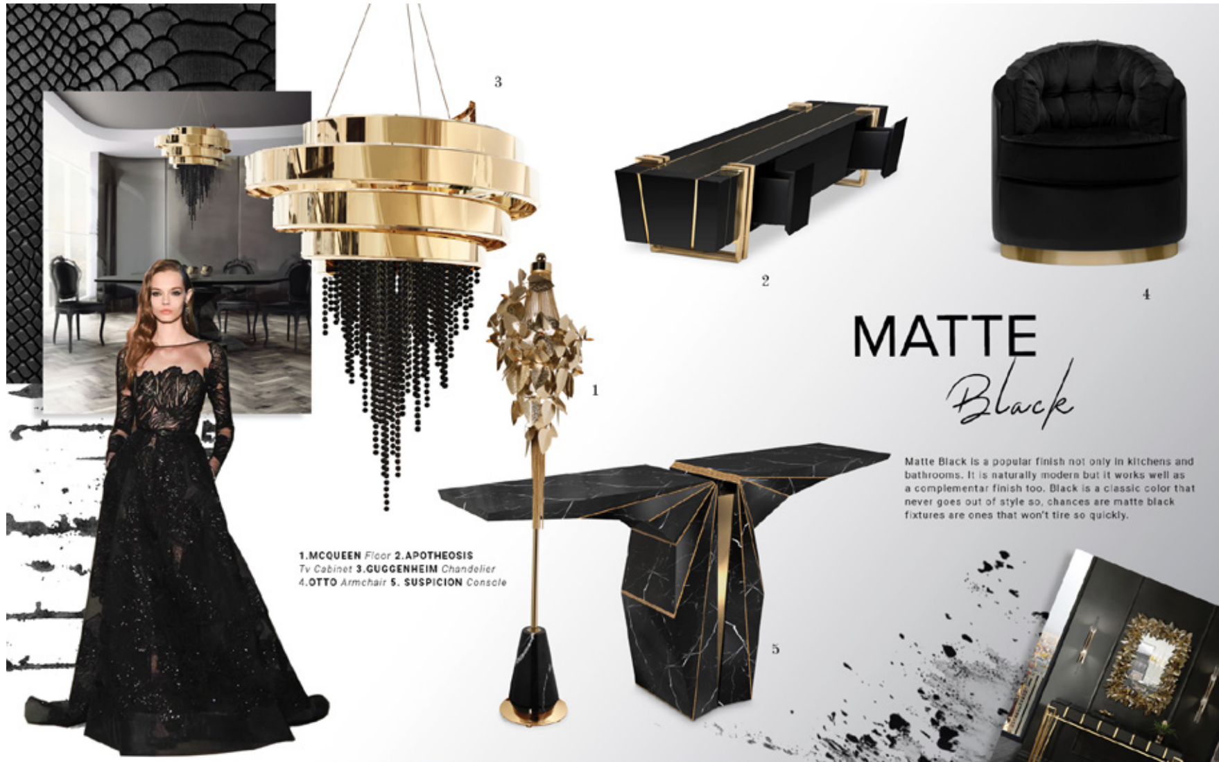
1. MCQUEEN Floor 2. APOTHEOSIS Tv Cabinet 3. GUGGENHEIM Chandelier 4. OTTO Armchair 5. SUSPICION Console