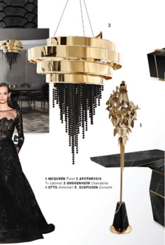
1. MCQUEEN Floor 2. APOTHEOSIS 7x Cabinet 3. GUGGENHEIM Chandelier 4. OTTO Armchair 5. SUSPICION Console