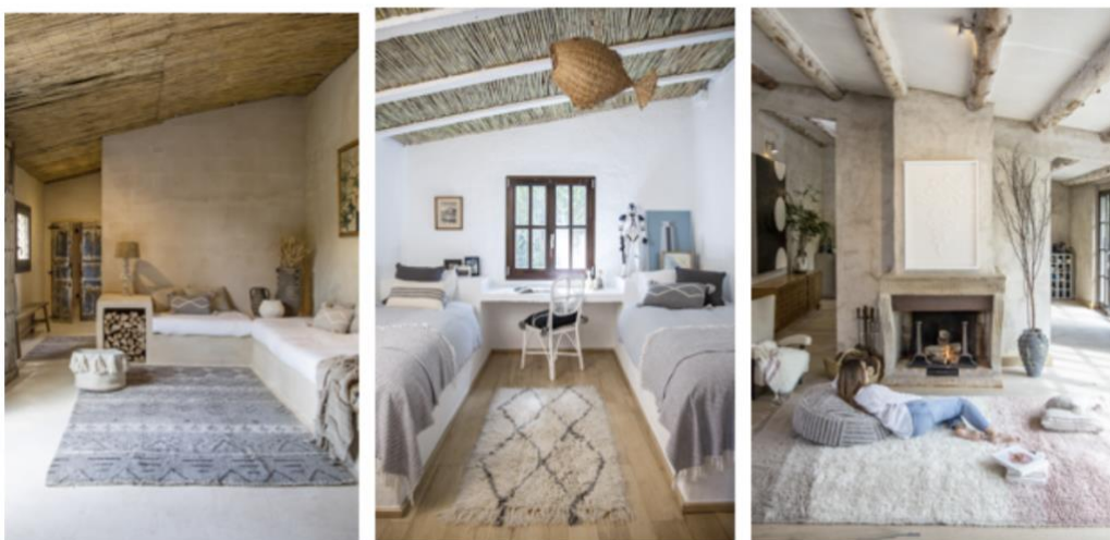
Woolable by Lorena Canals, the first wool washable rugs, Lakota Day, Bereber Soul and Sounds of Summer