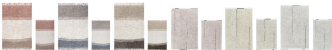
Wool washable rugs Sounds of Summer, Into the Blue, Forever Always 300x200cm and 140x200cm; and Spring Spirit, Autumn Breeze and Winter Calm 300x200cm and 140x200cm

Free Your Soul Collection, is made out of colors that make us feel good. Free Your Soul is a collection of 12 rugs that take us into a world of sensations with the intention of opening the soul and mind of the human being to get the best out of it. In this collection, Lorena Canals wanted to transmit sensations through each of the colors highlighting the importance they have on our welfare. Colors that transmit sensations and awaken emotions in the five senses.