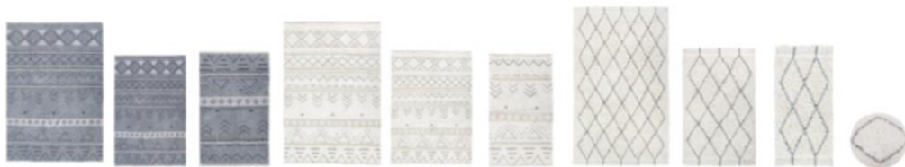
Wool washable rugs Lakota Day 170x240cm, 140x200cm and 140x80cm; Lakota Night, Bereber Soul 300x200cm, 140x200cm, 140x80cm and Pouffe Bereber

Bohemian Classic Collection, the most bohemian. Bohemian Classic is a collection of 9 carpets and 1 pouffe designed in a palette of soft colors, easily combinable in any environment of the house. The simplicity of the designs through the play of different textures and handcrafted finishes brings richness to each piece. The natural beauty provided by the texture of the wool, the carefully selected colors, the small details such as the hand knotted fringes, the mix of colors or the combination of different heights of the thread creating volumes that are comfortable and pleasant to the touch.