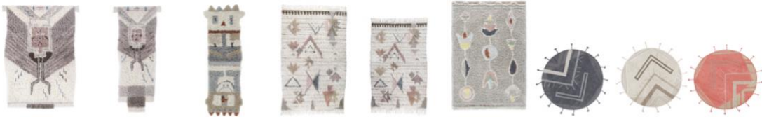
Wool washable rugs Zuni 170x240cm and 90x240cm; Kachina 90x240cm; Tuba 170x200cm and 170x240cm; Arizona 170x240cm and Hokan 160cm, Bannock 160cm and Chinook 160cm.

Hopi Collection is a collection with soul. Hopi has 9 carpets into this collection that are inspired by the Hopi people, where the oldest Native American tribe of the continent lives. An Indo-American culture deeply rooted in spirituality and believers that absolutely everything, even objects, have a soul. The designer also believes in the soul of things and is convinced that everything must have a soul. The aim of the Hopi collection is to transmit peace, mysticism and positivism through carpets inspired by art pieces from this tribe. The collection stands out for its neutral colors and hippy style that transmit the harmony and wisdom of the Hopis.