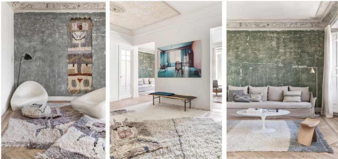
Wool washable rugs by Lorena Canals Kachina, Zuni, Autumn Breeze, Almond Valley and into the blue

Free Your Soul Collection, is made out of colors that make us feel good. Free Your Soul is a collection of 12 rugs that take us into a world of sensations with the intention of opening the soul and mind of the human being to get the best out of it. In this collection, Lorena Canals wanted to transmit sensations through each of the colors highlighting the importance they have on our welfare. Colors that transmit sensations and awaken emotions in the five senses.