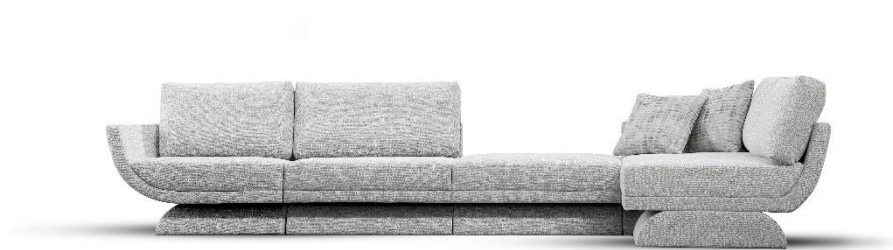
Oscar Modular Sofa

In effect, one of the stars of the tradeshow will be Oscar. Inspired by the curved lines poetry of Oscar Niemeyer's architecture, Oscar modular sofa allures for its sensual and free-flowing curves. Like Niemeyer once said "Curves make up the entire Universe" as this contemporary modular sofa will surely make up any living room adding a sophisticated and timeless appeal. When it comes to décor, this sofa offers endless possibilities.