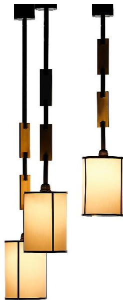
Chain Pendant Light

The lighting will be in charge of Chain pendant, an interesting and unique item made up of three hanging pendants each giving a soft, warm and inviting light. The chains are designed using a mix of brushed brass and dark bronze which creates a striking yet harmonious contrast.