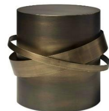
Orbit Accent Table