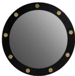
Cluster Rounded Mirror

Exploring the stellar theme and finding inspiration in outer space, DUISTT releases a series of designs. A pair of rounded mirrors, named Cluster, in black lacquered iron and brushed brass details will be behind the bar in two different diameters. The space will be also adorned with the sophisticated brass details of Ray Collection, which includes two coffee tables and one side table, and the Orbit accent table, a handmade brass structure involved by two rings which provide the graceful feeling of movement and stillness at the same time.