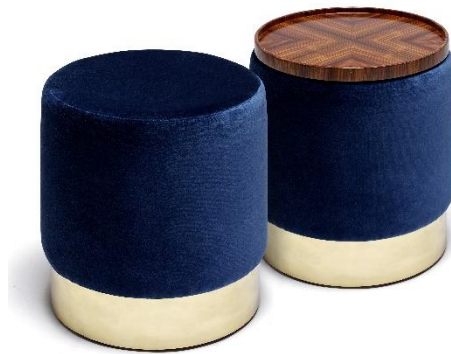
Lune C Stool

Also, the Lune C stool, a versatile piece that can be used as a stool or, with a wood tray on its surface, as small coffee table will be showcased.