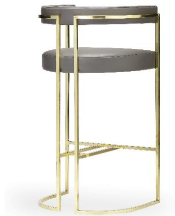
Julius Bar Stool

Also, the Lune C stool, a versatile piece that can be used as a stool or, with a wood tray on its surface, as small coffee table will be showcased.