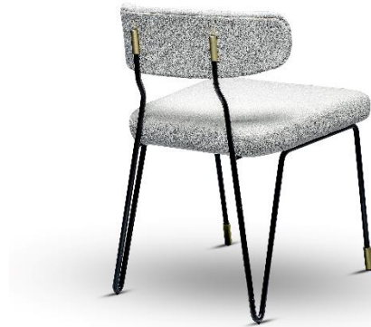
Apollo Dining Chair

Exploring the stellar theme and finding inspiration in outer space, DUISTT releases a series of designs. A pair of rounded mirrors, named Cluster, in black lacquered iron and brushed brass details will be behind the bar in two different diameters. The space will be also adorned with the sophisticated brass details of Ray Collection, which includes two coffee tables and one side table, and the Orbit accent table, a handmade brass structure involved by two rings which provide the graceful feeling of movement and stillness at the same time.