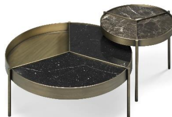
Ray Coffee Table and Side Table