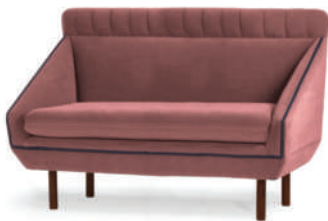
2019 Special Mention German Design Award Agnes Couch by Mambo Unlimited Ideas