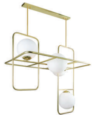
2019 Special Mention German Design Award Link by Utu Soulful Lighting

Follow on social media with #mambounlimitedideas Share and post on Instagram: @mambo_unlimitedideas Share and like on Facebook: www.facebook.com/mambo.unlimitedideas Share on Pinterest: @mambounlimited