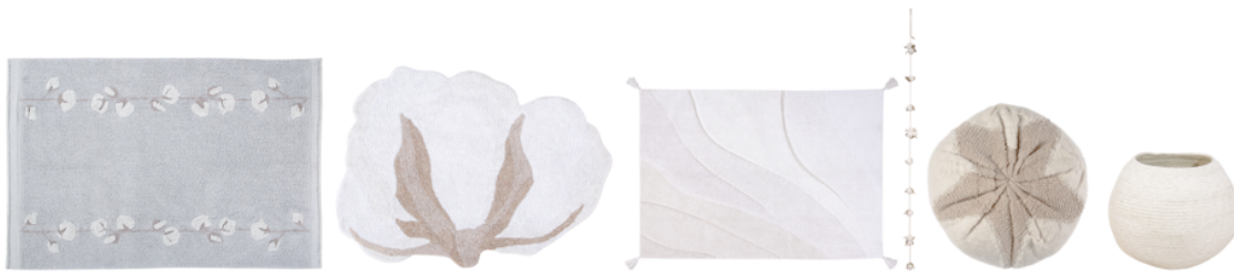
Rugs, cushion and basket from the Tribute to Cotton collection

Elegance: The English Gardens collection is inspired by the richness of colors and textures experienced in English botanical gardens, which captivated the designer as a child. Nature teaches us the importance of small details, and this point is highlighted by the elaborate finishes in this collection and the introduction of a new type of handmade knotted fringe. This collection has the largest number of accessories, comprising of baskets, a puff and garlands in pink, mauve and white with renewed and elegant floral designs.