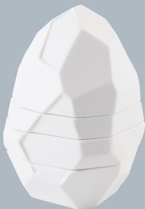
Rock, 3 secrets diameter 10 cm / 3.9", total height 14,5 cm / 5.7"