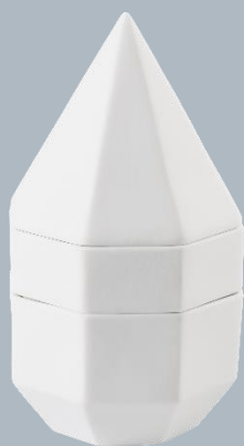
Diamond, 2 secrets diameter 8 cm / 3.1", total height 13,5 cm / 5.3"