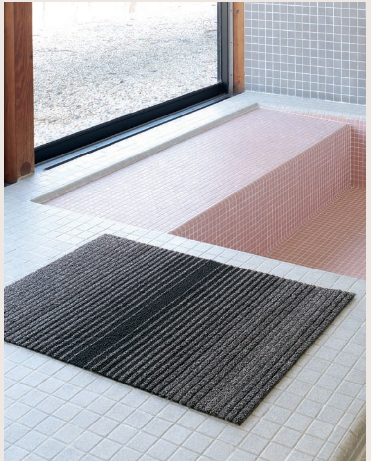
Utility Mat in GREY, Ombré Shag Plus

As Strike joins the collection of woven floor mats, the options for indoor/outdoor "Shag" mats expand significantly for Fall/Winter 2018 with the introduction of Shag Plus , which debuts in Ombré . Shag Plus combines phthalate-free vinyl yarns with moisture-wicking olefin. Like our signature indoor/outdoor floor mats, this quick-drying, tufted textile is especially durable and resistant to staining, fading, mold, and mildew. Ombré Shag Plus Mats are distinguished by shade-shifting stripes, offering a sophisticated way to add texture to indoor and outdoor spaces. It is available in Blue, Black, or Grey, in four sizes: