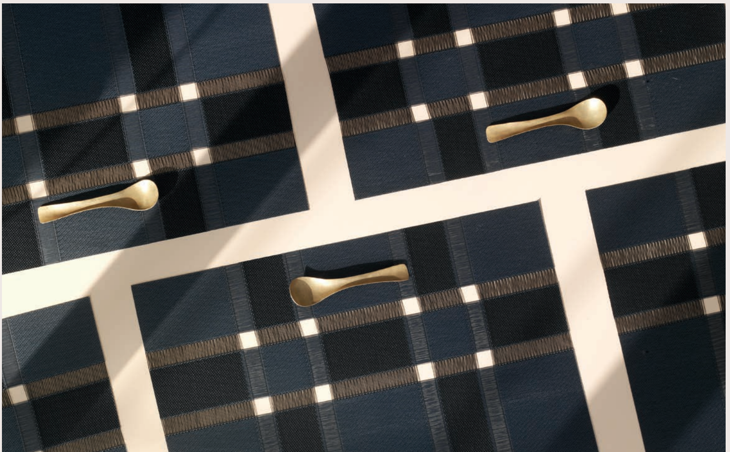
Placemats in SAPPHIRE, Interlace

(New York, NY – June 2018) For Fall/Winter 2018, Chilewich introduces a range of distinctive weaves and intricate techniques, along with bold, multi-dimensional colorways. These innovative textiles for the tabletop and floor offer new ways to incorporate the beauty and functionality of Chilewich designs into any home.