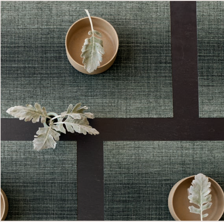
Placemats in JADE, Ombré