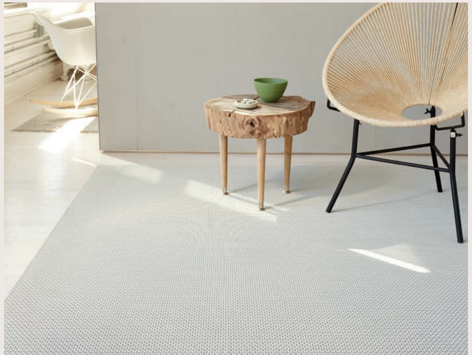
Woven Floor Mat in LIMESTONE, Strike

A companion to Pickstitch, Strike was also inspired by character-laden boro textiles. This especially versatile weave was designed to provide a graphic foundation for any room or table. The high-contrast palette highlights the intricate pattern of paired stitches, which are arrayed in a subtle pattern that is at once geometric and dynamic. Available as a placemat and floor mat in two colorways: Black and Limestone.