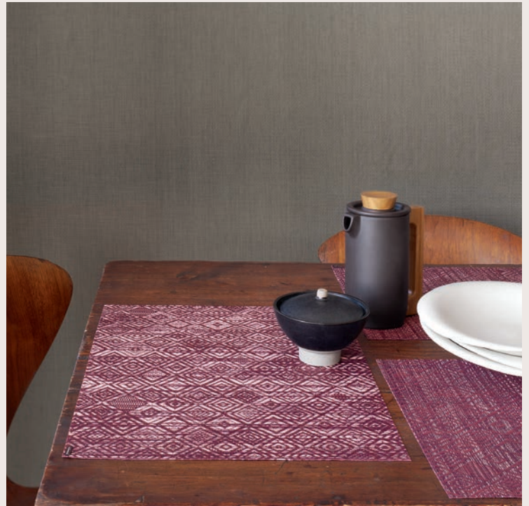
Placemats in PLUM, Mosaic