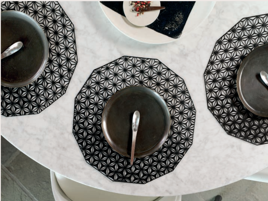
Placemats in BLACK, Kaleidoscope