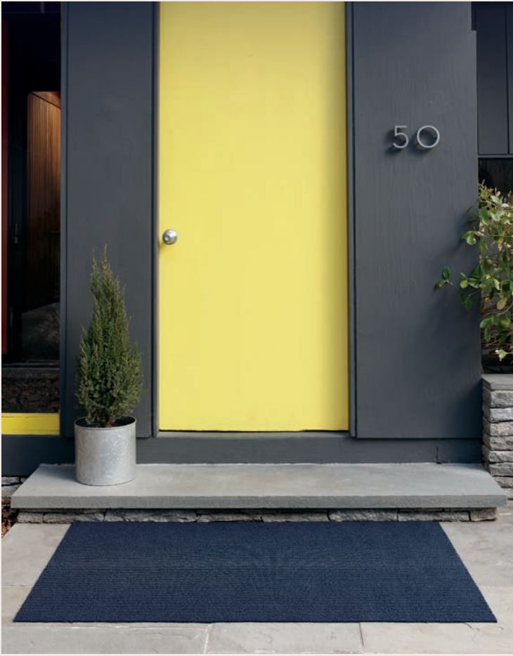
Big Mat in BLUE, Ombré Shag Plus