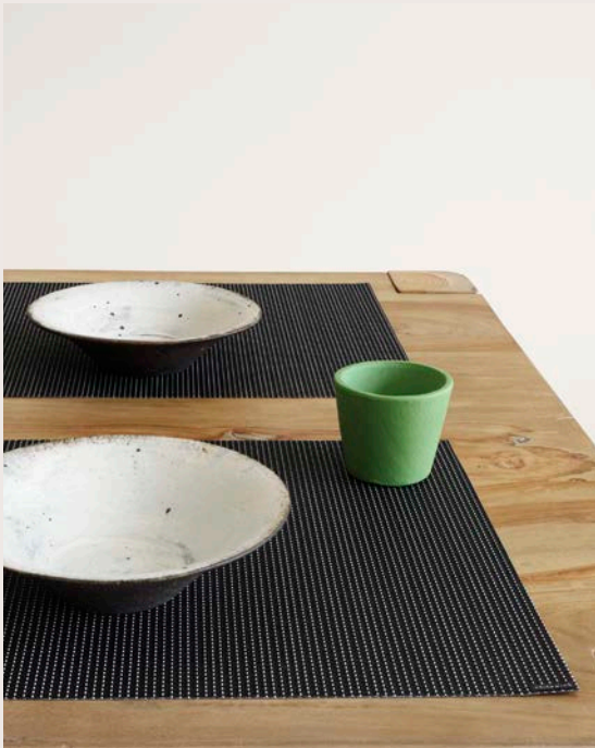
Placemats in BLACK, Pickstitch