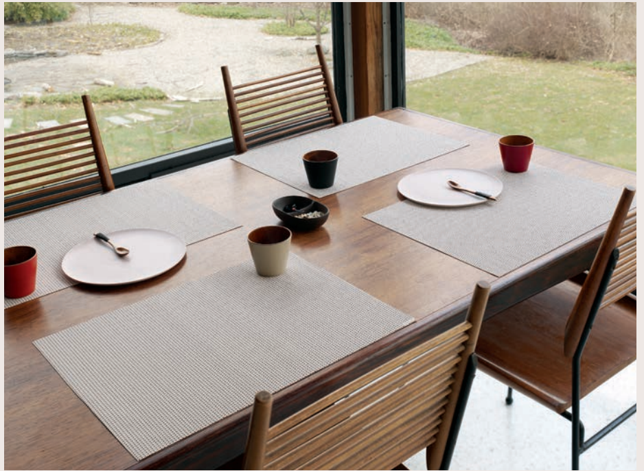
Placemats in LIMESTONE, Pickstitch

The intense handworking of boro, the Japanese textiles born from necessity rather than aesthetics, was a starting point for Pickstitch, a foundational new style. Developed and refined on a handloom at our New York studio, the dynamic rows of stitched lines are both texture and pattern, accentuated by a graphic contrast of threads. Available as a placemat and floor mat in two colorways: Black and Limestone.