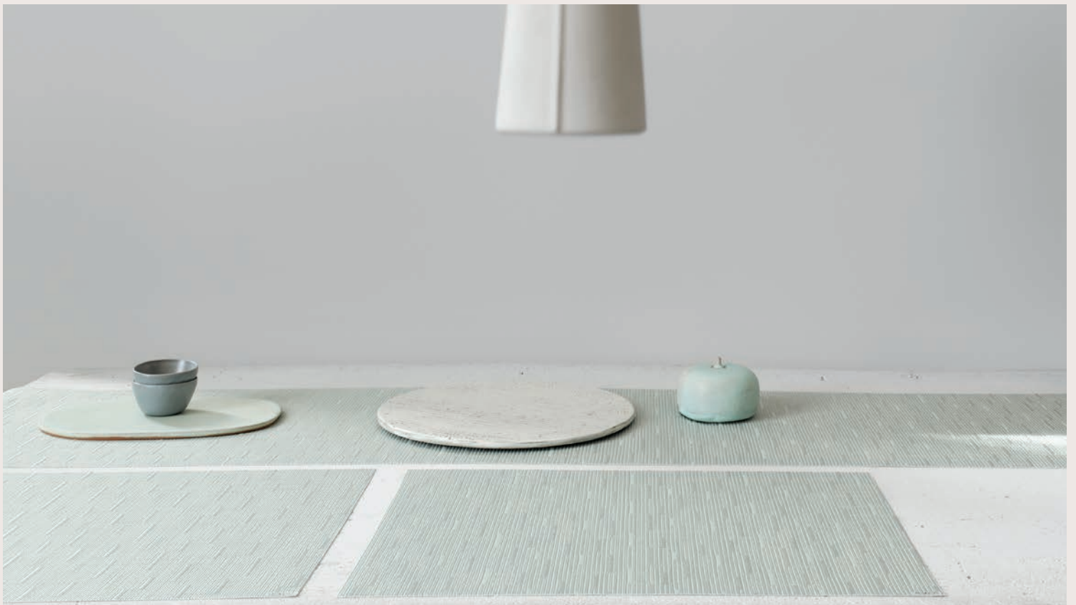
Placemats in SEAGLASS, Bamboo

New to the iconic Basketweave tabletop collection are rich, autumnal hues of Jade, Plum, and Pomegranate, while the Mini Basketweave range expands with the versatile Mist colorway. The popular Bamboo collection gains depth with jewel-like tones of Seaglass and Rhubarb for the table, and Mosaic debuts in deep Plum for both tabletop and floor mats. Ombré's new Jade and Gold colorways arrive just in time for holiday entertaining.