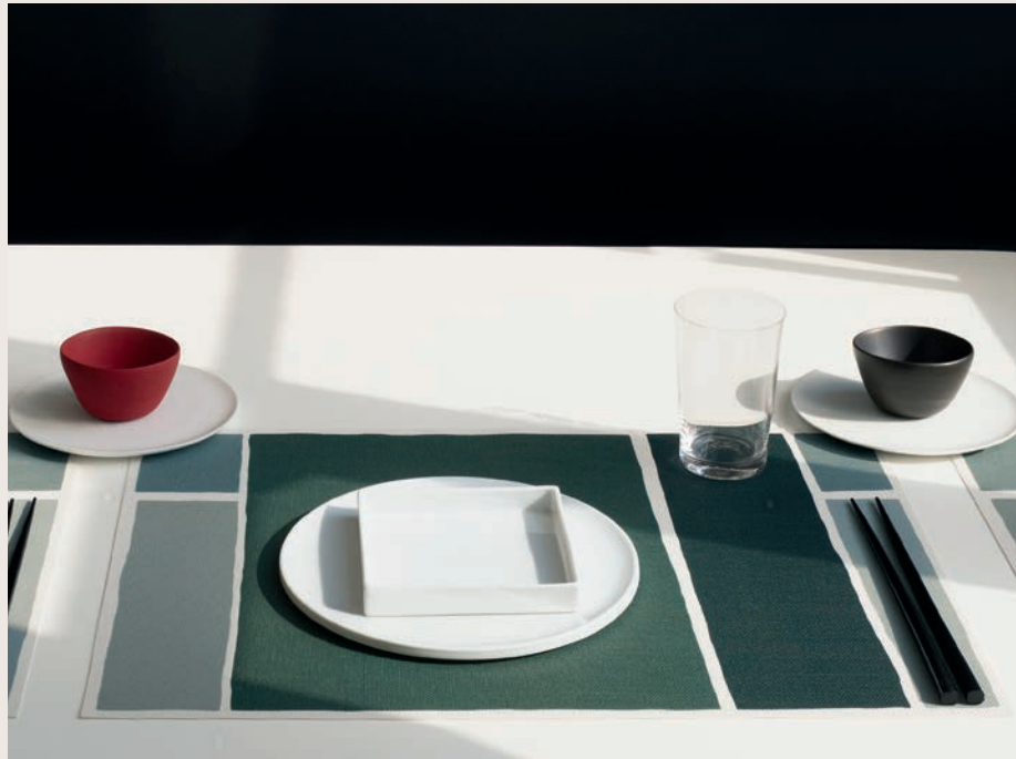
Placemats in JADE, Maptone

A striking addition to Chilewich's popular "pressed" designs—non-woven textiles created using special molds—is Kaleidoscope. Inspired by Japanese kumiko wood crafting used for centuries to create intricate latticework screens, it is a gleaming exploration of tessellations: patterns of shapes that fit perfectly together. The traditional Asanoha motif (often used on kimono) was the starting point. Available in four colorways: Black, Brass, Gunmetal, and Pink Champagne.