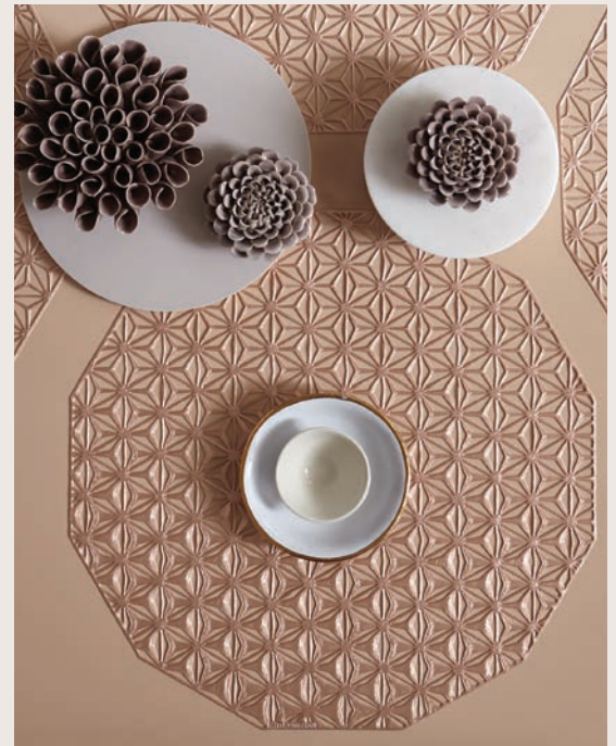
Placemats in PINK CHAMPAGNE, Kaleidoscope

A striking addition to Chilewich's popular "pressed" designs—non-woven textiles created using special molds—is Kaleidoscope. Inspired by Japanese kumiko wood crafting used for centuries to create intricate latticework screens, it is a gleaming exploration of tessellations: patterns of shapes that fit perfectly together. The traditional Asanoha motif (often used on kimono) was the starting point. Available in four colorways: Black, Brass, Gunmetal, and Pink Champagne.