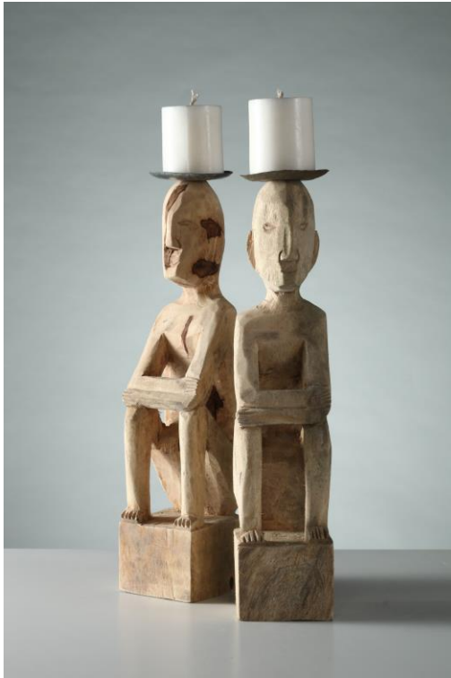
Candelabra by CHANALLI

The high art culture lives on in these Filipino ethnic and tribal sculpted candelabra that fit most with cultivated taste. Combining the country's colonial and Asian influences, these hand-carved candle holders from Chanalli possess the true mark of outstanding artisanship where, lies in the small details are the execution and precision of the hands that created them. Chanalli's heads and hands, busts, mannequin, and icons are impressive pieces to behold and own.