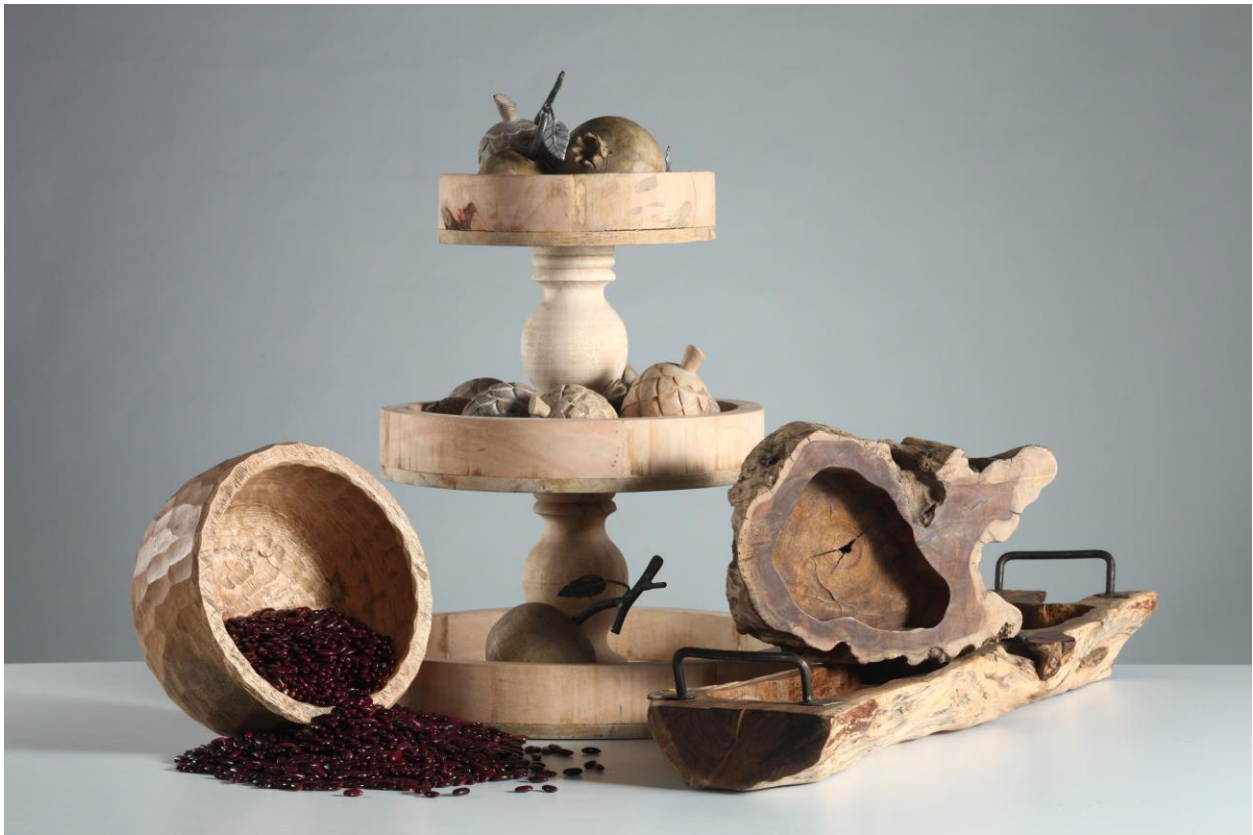
Fruit Basket by BASKET AND WEAVES