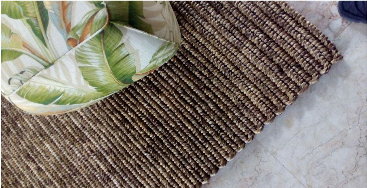
Abaca Carpet by WEAVEMANILA, INC.

Because of its texture, abaca —the sturdiest of natural fibers— is the perfect material for rugs and mats. The stringent process raw abaca undergoes prior weaving contributes to the soft and luxurious texture of these mats and carpets. Centuries-old techniques, combined with ingenious designs contributed to the product's ability to evoke luxurious feel and comfort. The secret techniques to weaving these mats have been passed down from one generation of artisans to another; keeping up with the times with combined function and form.