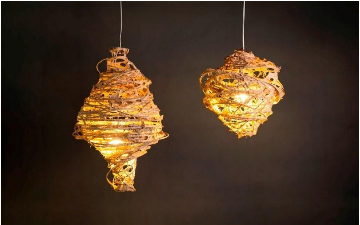
Beehive Lamps by CDO HANDMADE PAPER CRAFTS

Using natural fibers sourced from the indigenous tribes from the south Philippines, CDO Handmade paper produce leatherized paper engineered into sturdy, eccentric lighting fixtures. CDO Handmade maximizes the sustainability and abundance of raw materials to create decorative yet functional pieces. These beehive lamps made from bamboo skin add warmth and sophistication to every home.