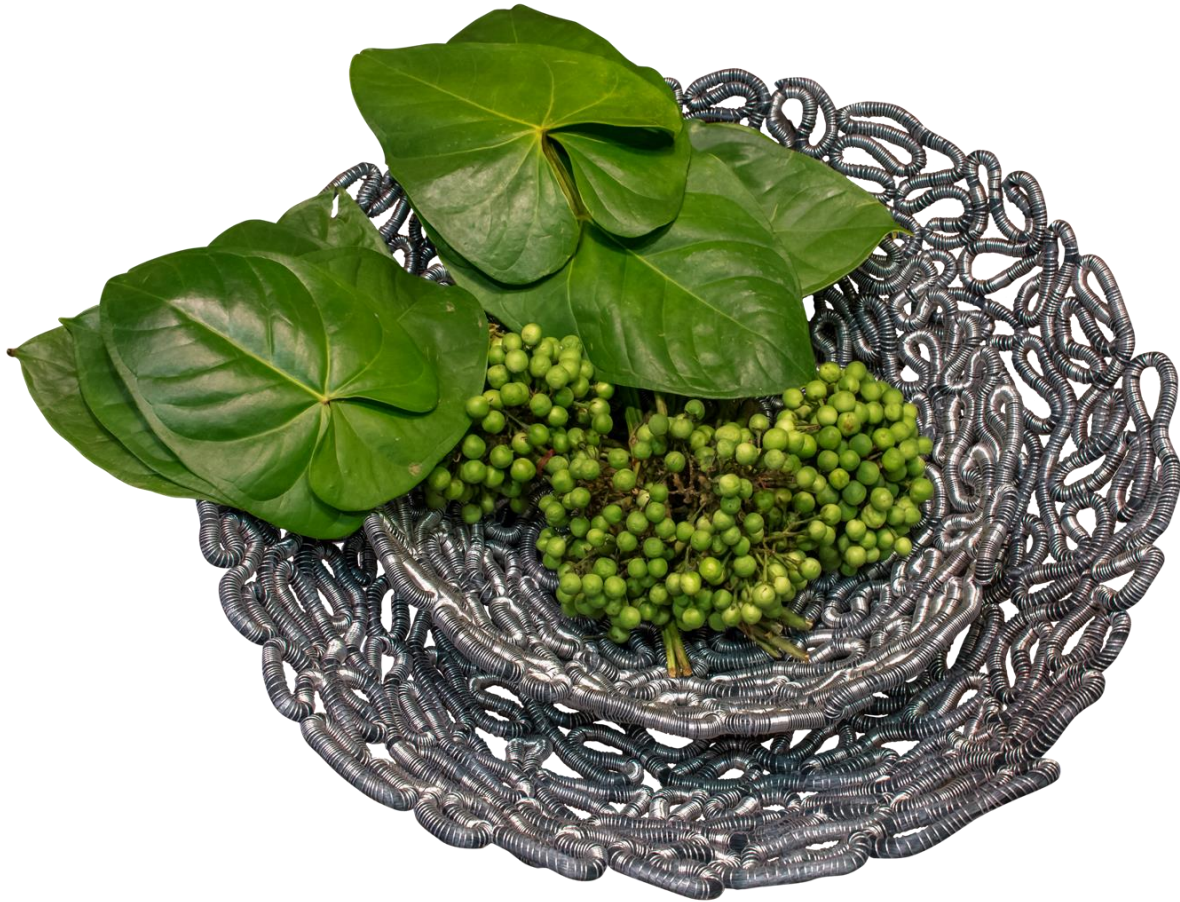
Coral Brain Bowl by TADECO

Trading as one of the Philippines major banana exporter, TADECO is well acquainted with natural fibers. Their table accents, lamps and lighting, and a whole new range of home pieces from natural fibers and handwoven fabric turn the distinct features of local materials into pieces for the global home.