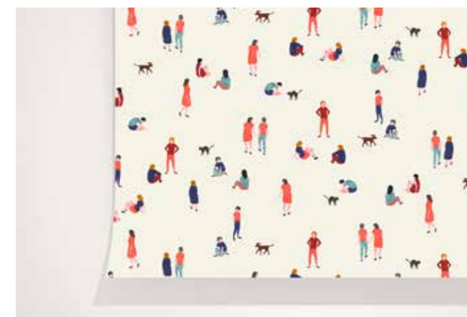
PP-S1809 - Promenade