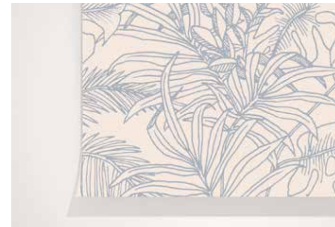
PP-S1803 - Abondance