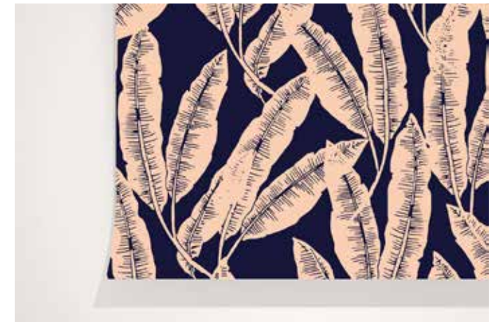
PP-S1806 - Plumes