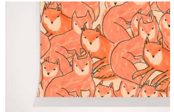
PP-S1804 - Fox croud