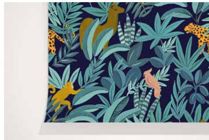
PP-S1802 - Animalia