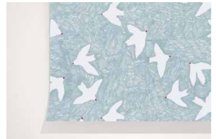
PP-S1808 - Ciel de Paris