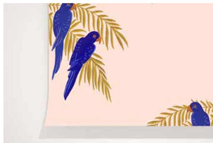
PP-S1801 - Parrots

www.seasonpapercollection.com Julie Costaz & Mélissa Le vaguerèse bonjour@seasonpapercollection.com 06.71.26.50.21 / 06.08.18.44.50