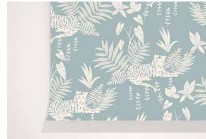
PP-S1805 - Jungle