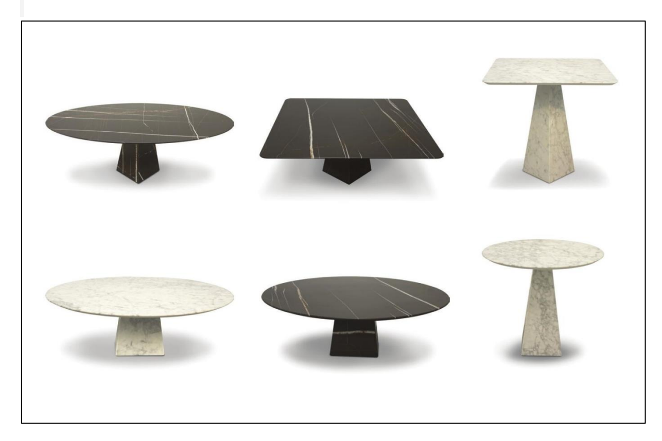
OIA – the current COSMOS' series