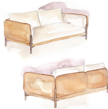
December 2017

From her sofa, one can imagine basking on a veranda and letting the mind wander beyond the Dune du Pyla whose long sandy peak sits on the horizon.