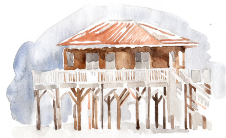
December 2017

If these huts, subject to the harshness of storms and exposed to the tireless movement of the tides, inspire a sense of durability, they also bring a historical charm to the object and undoubtedly highlight the French know-how.