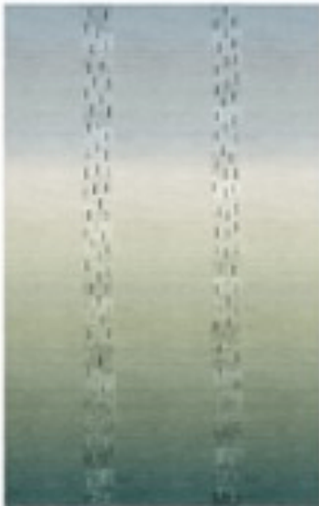
Rivulets, size 1.90 x 3.00m