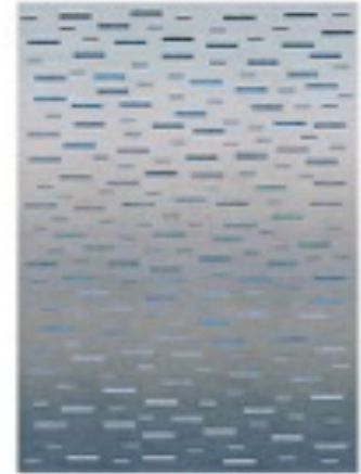
Sea mist, size 1.70 x 2.35m