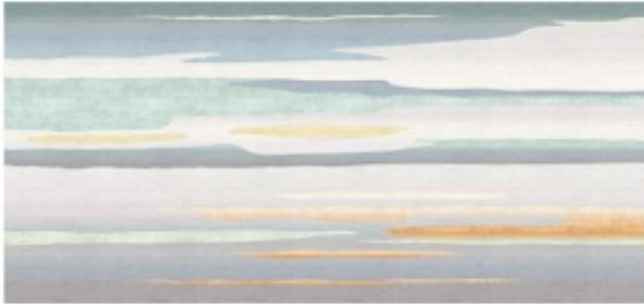
Skyscape, size 2.35 x 5.00m