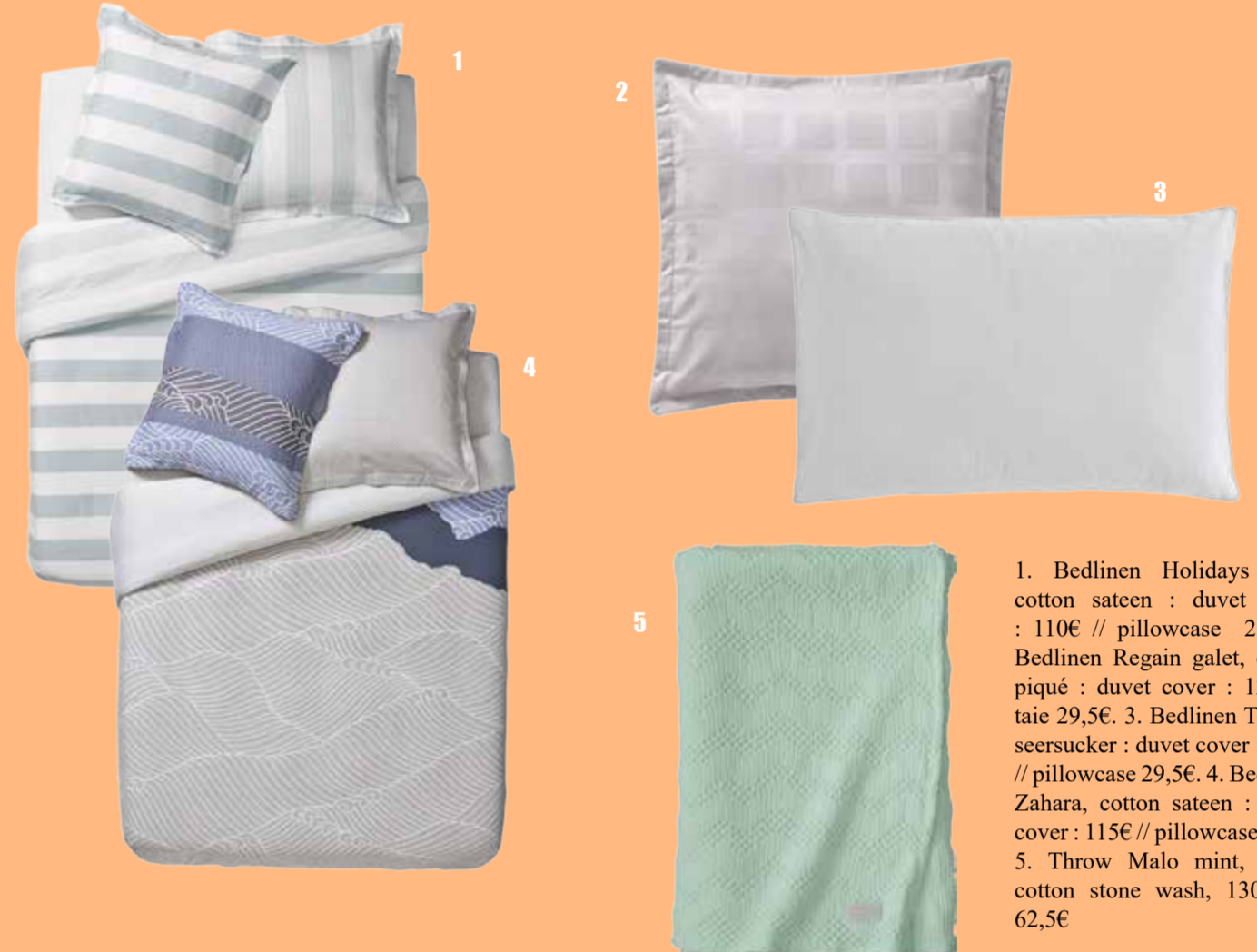
1. Bedlinen Holidays jade, cotton sateen : duvet cover : 110€ // pillowcase 25€. 2. Bedlinen Regain galet, cotton piqué : duvet cover : 129€ // taie 29,5€. 3. Bedlinen Tempo, seersucker : duvet cover : 129€ // pillowcase 29,5€. 4. Bedlinen Zahara, cotton sateen : duvet cover : 115€ // pillowcase : 24€. 5. Throw Malo mint, 100% cotton stone wash, 130x170, 62,5€