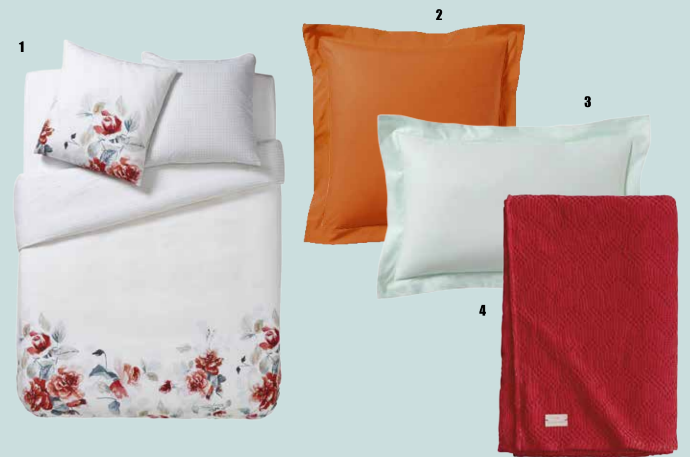
1. Bedlinen Émotion, percale cotton : duvet cover 129€ // pillowcase : 35€. 2. Bedlinen épice, percale cotton : duvet cover : 129€ // pillowcase : 21,5€. 3. Bedlinen mint, percale cotton : duvet cover : 129€ // pillowcase : 21,5€. 4. Throw Malo sienne, 100% cotton stone wash, 130x170, 62,5€.