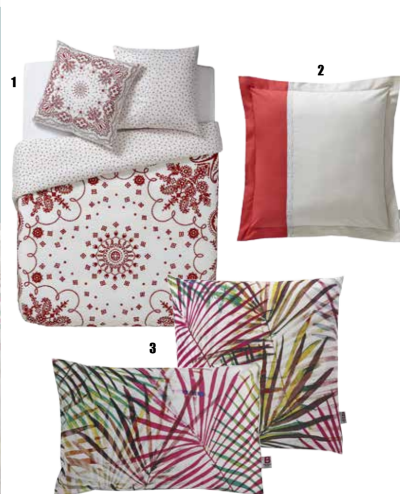
1. Bedlinen Bandana red : duvet cover 129€ // pillowcase 33,5€. - 2. Bedlinen Toi & Moi Bandana : duvet cover 129€ // pillowcase : 33,5€. - 1. Bedlinen Tropic : duvet cover 129€ // pillowcase 33,5€. Collab' Essix x Bensimon