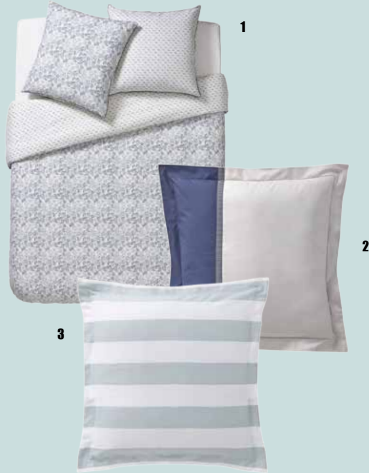
1. Bedlinen Cadence, percale cotton : duvet cover 129€ // pillowcase : 35€. 2. Bedlinen Toi & Moi Zaharah blue, percale cotton : duvet cover 129€ // pillowcase 29,5€. 3. Bedlinen Holidays jade, sateen cotton : duvet cover : 110€ // pillowcase : 25€